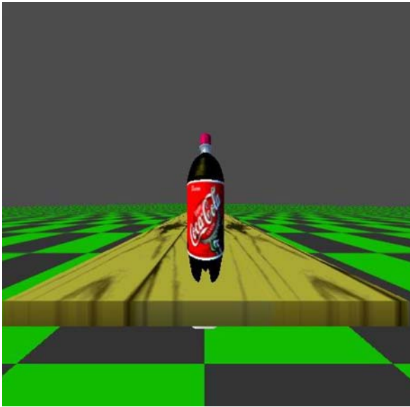
FIGURE 1. The ENV visual scene contained a number of monocular cues to depth. The patterned floor and textured table provided information for the subject to make size judgments. The floor and table were absent in the NoENV visual scene so that only the bottle and a grey background was present (Image not to scale).

bottle was 12 in. tall and 5.5 in. (maximum) wide. The coke bottle was lit by a spotlight mounted on the left hand wall of the CAVE at a height of 10 ft and at a distance of 8 ft from the front CAVE wall.