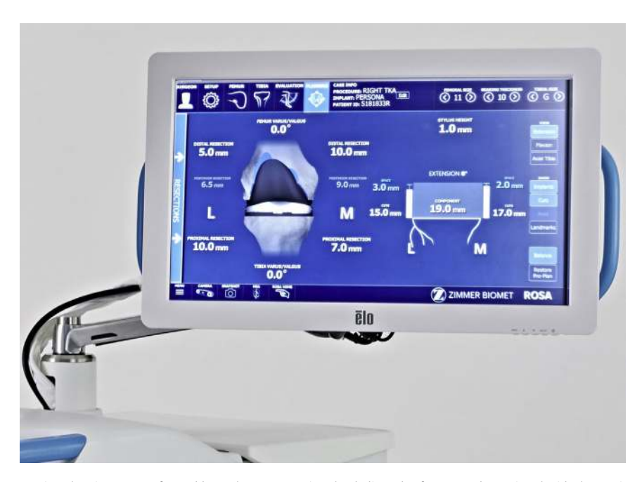
Fig. 1. Following this step, intraoperative planning was performed by each surgeon, using the dedicated software, to determine the ideal resection thickness and angle to obtain a balanced and well-aligned TKA.

computer system then calculated the discrepancy between the planned cut (depth, frontal, and sagittal angles) compared to the cut performed using the robotic system.