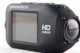
Drift Ghost HD