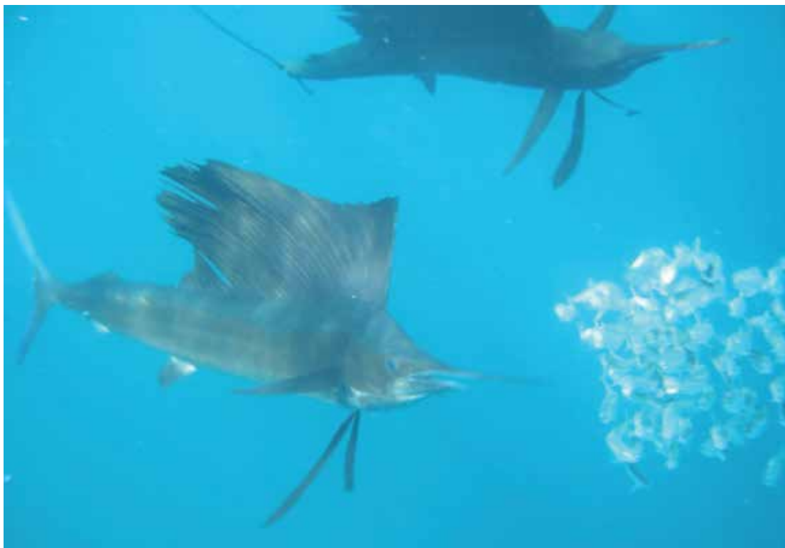
Figure 3. Action camera footage that captured a feeding event of an Atlantic Sailfish chasing a school of sardines.