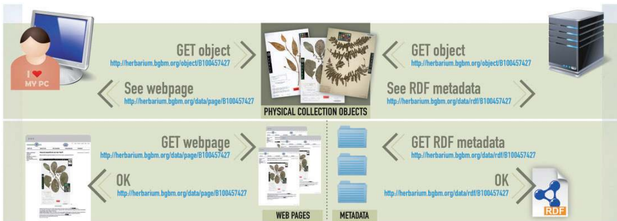
Figure 2. Basic redirection mechanisms. Human users are redirected to a human-readable web-representation of the specimens. Software systems are re-directed to a machine-readable metadata record.

collections. The awareness of the need for appropriate management procedures is already growing with the increasing use of CETAF stable identifiers in taxonomic workflows.