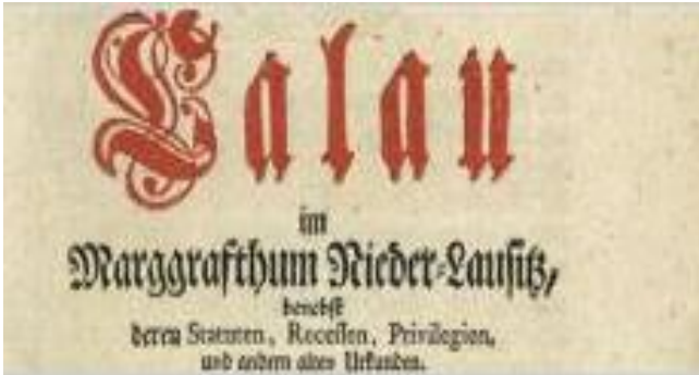
Figure 1. Original image

If 'D' depends on the image 'u', this becomes a non-linear diffusion filtering [6]. Which sharpens the edge over a range of slope scales with reduction in noise as well as conserving the feature boundaries [8]. Figure 1 is taken from DIBCO 2009 dataset and figure 2 shows the edge enhanced diffusion applied on the grayscale image of figure 1.