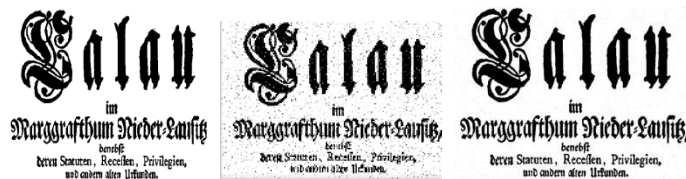
Figure (11) Image(a) Original (b) Salt & pepper 0.01 Noisy (c) SplitBregman