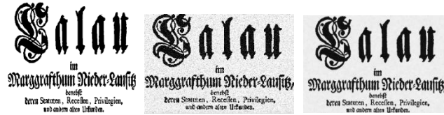
Figure (6) Image(a) Original (b) Gaussian 0.03 Noisy (c) SplitBregman