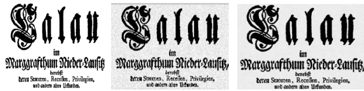
Figure (12) Image (a) Original (b) Salt & pepper 0.03 Noisy (c) Split Bregman