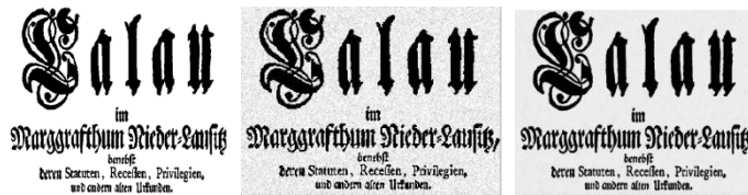
Figure (9) Image (a) Original (b) Speckle 0.03 Noisy (c) SplitBregman