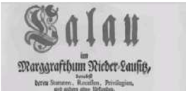
Figure 2. Edge enhanced diffusion