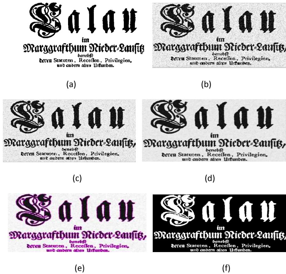
Figure 4. a) Original image taken from DIBCO 2009 dataset b) Gaussian noise added to the image c) image obtained after edge enhanced diffusion operation d) denoised image obtained after applying Split Bregman algorithm e) contour formed using level set method f) segmented and binarized output.