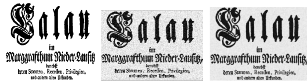
Figure (5) Image (a) Original (b) Gaussian 0.01 Noisy (c) Split Bregman