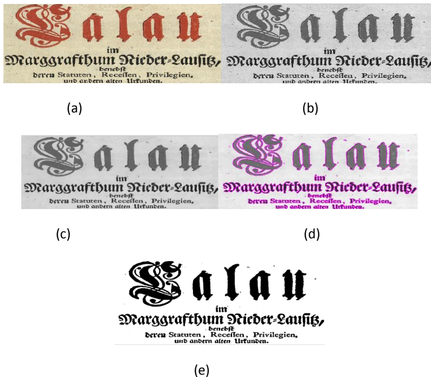
Figure 4. a) Original image taken from DIBCO 2009 dataset b) image obtained after edge enhanced diffusion operation c) image obtained after applying split bregman algorithm d) contour formed using level set method e) segmented and binarized output

By setting proper \mu and lambda, the actual denoised, edge enhanced, binarized output is obtained.