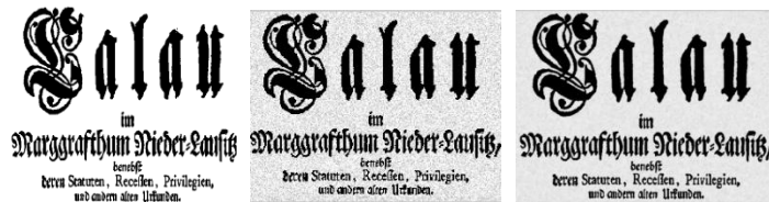
Figure (10) Image(a) Original (b) Speckle 0.05 Noisy (c) SplitBregman