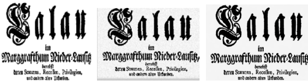
Figure (8) Image(a) Original (b) Speckle 0.01 Noisy (c) SplitBregman