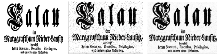
Figure (13) Image (a) Original (b) Salt & pepper 0.05 Noisy (c) Split Bregman