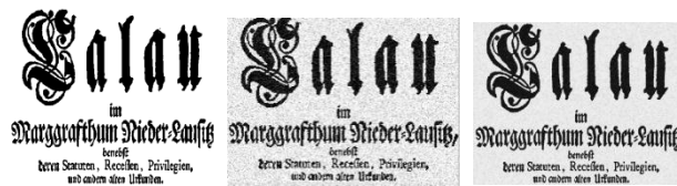
Figure (7) Image (a) Original (b) Gaussian 0.05 Noisy (c) Split Bregman