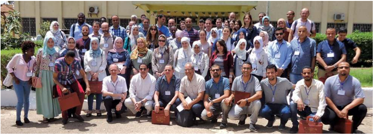
FIGURE 7. A group photo from AGR3S 2018.

to set up common national projects with socioeconomic impacts