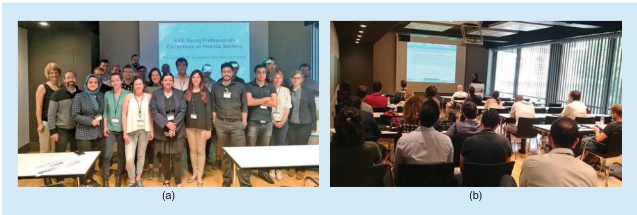
FIGURE 3. The 2018 IEEE Young Professionals Remote Sensing Conference: (a) a group photo of participants and (b) one of the oral sessions.