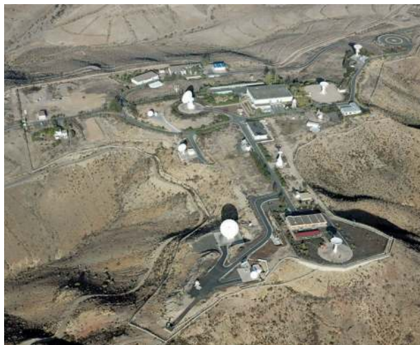
FIGURE 5. A panoramic view of the Maspalomas Tracking Station, managed by the Instituto Nacional de Técnica Aeroespacial.