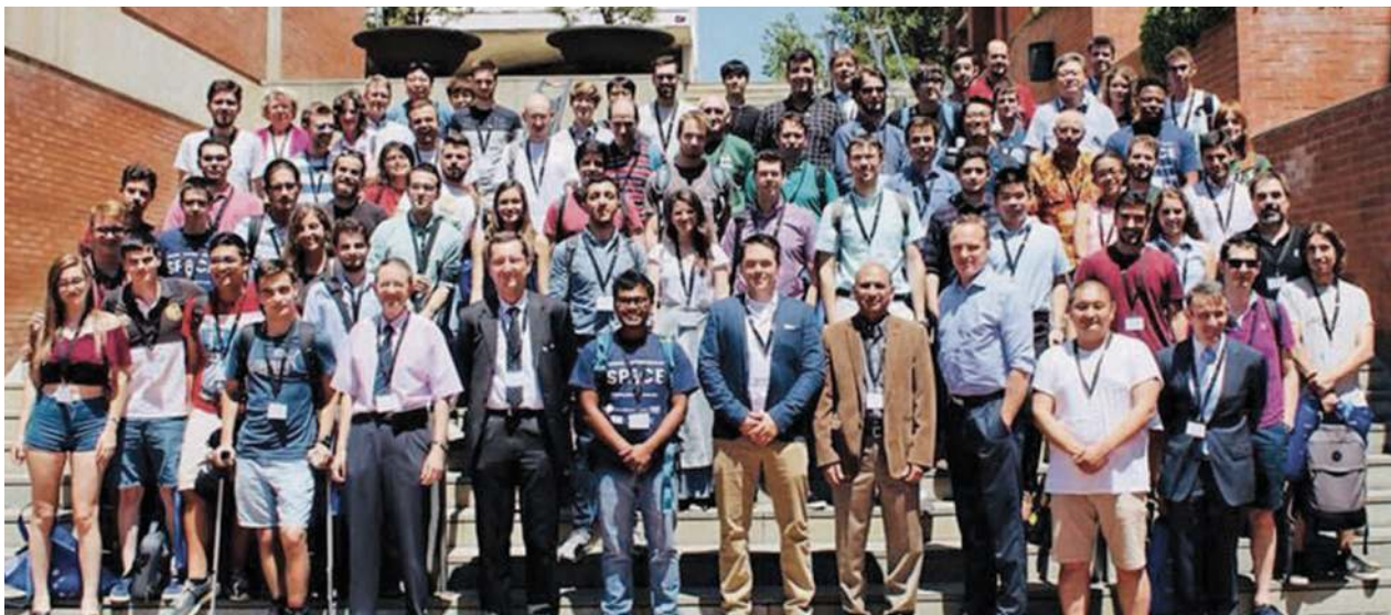
FIGURE 4. Attendees, professionals, and organizers from the 2018 Young Professionals in Space Conference in Barcelona.