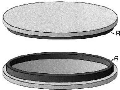
Figure 1. Diagrammatic drawing of the capsule used in the experiments, made of two glass disks and two stainless steel rings (R).

the reservoir was charged with 1 ml of solution; the distance of the sprayed surface from the bottom end of the tube was 11 mm; a nozzle 0.0275 inches was used. Only glasses uniformly sprayed with droplets of the solution were used; those showing a coarse pattern of drops were discarded. The pressure was adjusted (usually in the range 350–500 hPa) until the amount of solution deposited was 1 \pm 0.05 \text{ mg/cm}^2 . After drying (which took about 15 minutes), the disks with the glued ring were assembled into a capsule having the inner sides sprayed, and kept together with small pieces of beeswax.