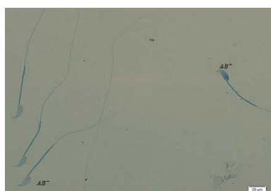
Figure 1. Aniline blue staining in 200Au/35 group. Normal spermatozoa are seen in light blue and abnormal spermatozoa are seen in dark blue ×100.