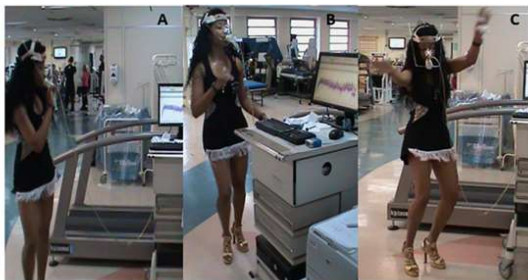
Figure 1 shows the monitoring of the samba dance by 40-minutes.

VO 2 , oxygen consumption; HR, heart rate; PO 2 , Pulse of oxygen; RQ, respiratory quotient; CHO/FAT, percentage ratio of carbohydrate and fat utilization during dance by RQ; EE, energy expenditure; MET, metabolic equivalent; RPE, ratings of perceived exertion. ANOVA, post hoc Holm-Sidak test * significant (P <0.05).