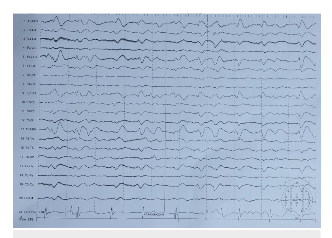
FIGURE 3: EEG showing severe diffuse encephalopathy of non-specific nature.