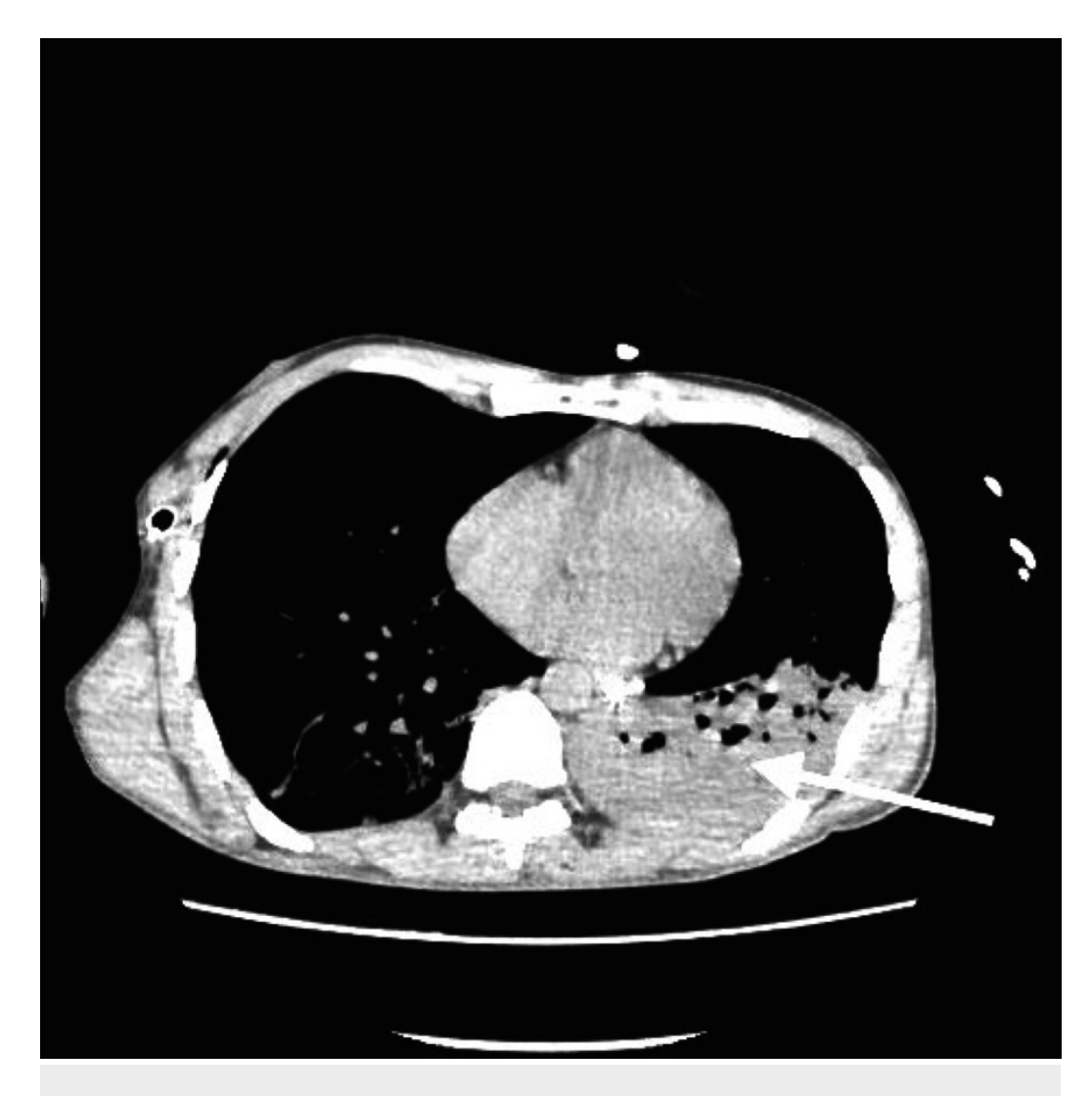
FIGURE 2: Computed tomography showing large left lower lobe consolidation.

Based on history, clinical presentation and laboratory investigations, a differential diagnosis of metabolic encephalopathy, and toxic encephalopathy due to sepsis, possible brain stem diseases and drug overdose were considered. CT of the brain was normal. Treatment was initiated with right chest tube placement for pneumothorax and the patient was given continued ventilator support. Empiric treatment for meningitis, seizure prophylaxis, and 1/2 normal saline was administered for hypernatremia. Lumbar puncture was done and cerebrospinal fluid (CSF) analysis came out negative for meningoencephalitis.