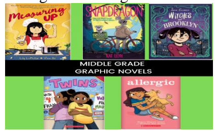
Pig 1. Graphic novels for Middle Grade

The use of literature in the EFL classrooms has advantages in several major fields [10]. Literature is beneficial for language development. It is an excellent resource for accurate speech, a variety of texts, and passionate stories [4]. Literature deals with accurate speech because it is related to real circumstances [11]. The language used in literature is the language of its audience, so it should not be inaccurate [12]. Also, literature deals with different moods and circumstances, so different forms of speech are popular [13]. In fact, speaking and writing by people are different. Therefore, literature has all these different forms of speech using the law [7]. It has its own heat, literature has the value of the text when it is read [3]. Engagement is generally considered an important element of the learning environment, especially in English learning.