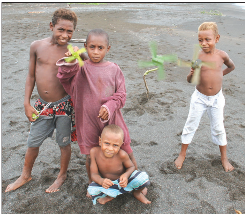
Figure 3. Children in the Solomon Islands play with home-made windmills.