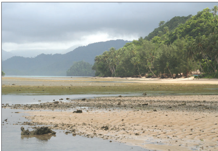
Figure 1. Nowhere are human and ecological systems more interdependent than in small island nations like the Solomon Islands, which today are under pressure from environmental and social phenomena at all scales.

tions (Connor and Dovers 2004; Rushmer et al. 2004), which in turn create the potential for broader changes in the societies in which institutions are embedded, including abandonment of behaviors that have negative impacts on ecosystems.