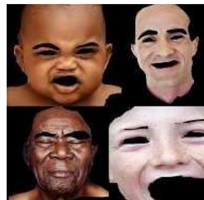
Fig. 2. Manually segmented training data.

compared to their correspondences in the last frame in the sequence given in frame 3. Four small regions have been