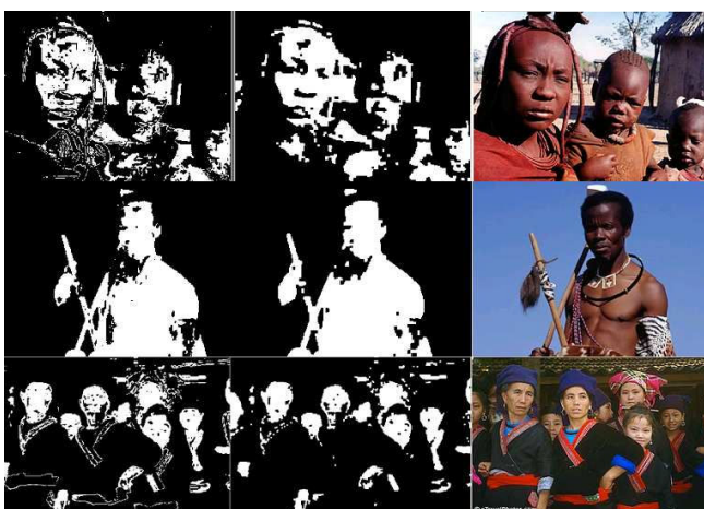
Fig. 4. Skin color regions segmented using non-adaptive GMM (left), proposed method (middle), and the original image (right).

An adaptive skin color segmentation algorithm based on Gaussian Mixture Model (GMM) has been proposed which can adapt the model parameters to cope with the changing imaging conditions such as lighting and noise. The algorithm considers the higher level a-priori knowledge of spatial and temporal relationship between the pixels in a video sequence. The experimental results show the superiority of the proposed algorithm compared to non-adaptive parametric models. Further improvement can be achieved by incorporating application specific information such as human motion models or face-hand detectors. The proposed method may also be used in surveillance systems and motion detectors.