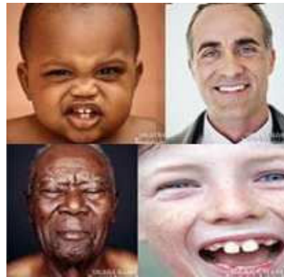
Fig. 1. Samples from training data.

The initial training of the Gaussian components is carried out using a data set of skin color pixels that includes 127,352,563 pixels. The training images have cautiously been selected to cover almost all ethnic groups and imaging conditions. The training images were manually segmented before parameter estimation. Figure 1 shows a subset of the training images and Figure 2 shows them after being manually segmented. The color space used is YCbCr. To reduce the effect of illumination, Y channel has not been considered through out the segmentation process. We start the initial EM stage with five components. This assumption is based on our intuitive classification of the skin samples using their appearance color. The second stage of EM algorithm tries to optimize the number of components. According to the results of this stage, the optimum number of components is seven. The adaptive algorithm uses the results of this stage for segmentation. Figure 3 shows a sequence of frames indicating changes in lighting condition. Some pixels from the first frame have been