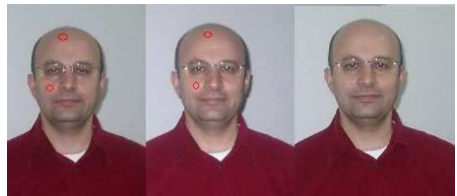
Fig. 3. A video sequence with changing lighting condition.

compared to their correspondences in the last frame in the sequence given in frame 3. Four small regions have been