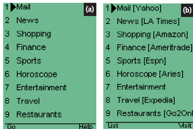
Figure 3. Adaptive defaults save the user time when visiting frequently accessed sites: (a) wireless portal menu; (b) adaptive defaults on menu.

We found that a combination of similarity-based methods [6], Bayesian methods [7], and collaborative methods [1, 10] meets the preceding requirements by achieving a balance of learning and adapting quickly to changing interests while avoiding brittleness. However, we take editorial input into account in ordering content for delivery by boosting the priority of lead stories. The effect is that first-time users of the wireless site see articles in the same order as on the wired Web site and all users always see the lead story in each section, allowing the adaptive personalization engine to learn more about each user. Finally, the similarity-based methods also are used to make sure a variety of news articles, products, or restaurant listings is presented on each screen in much the same manner a newspaper does not fill the front page with articles on