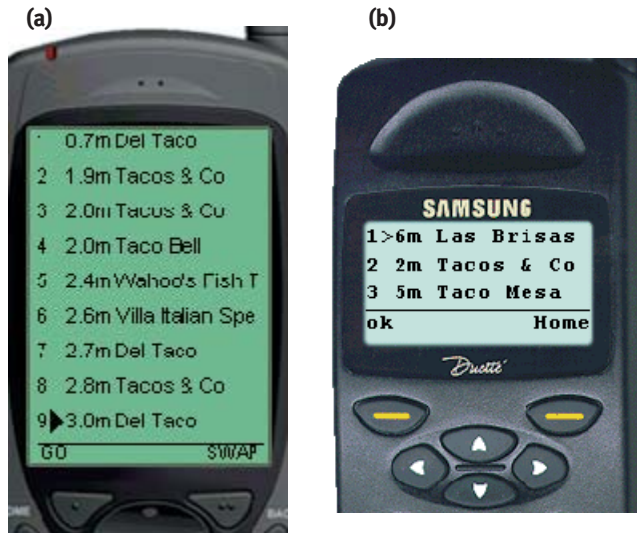
Figure 2. A personalized restaurant finder locates nearby restaurants that match the user's interests. Other services simply list restaurants by distance. With a small screen, it's important to put the most personally useful options first: (a) location only; (b) location and personalization.

email are signs of strong interest. In this case, let's assume the user just goes back to the list of ads displayed in (b) and then hits 9 to see more ads. The next page of ads (e) has been personalized for the user and shows cars similar to the car viewed. Although, in many cases, quickly honing in on that model would be helpful to the user, when the user doesn't select one of the similar ads and looks for more ads, negative feedback is given to the adaptive interface and a more diverse group of cars is displayed (Figure 1, part f).