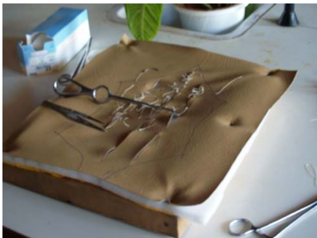
Figure 5 Picture of model used for laparotomy skills station.

appropriate placement of the vacuum on the fetal head and developed proper delivery traction with the vacuum.