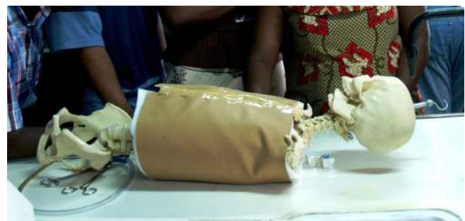
Figure 4 Picture of skeleton model for chest tube insertion skills station.

For the vacuum-assisted vaginal delivery, we used an obstetrical mannequin on which students practised