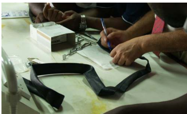
Figure 6 Picture of inner tube models for bowel anastomosis station.

Development and execution of the training required a total of 290 work-hours (Table 2). The execution of the surgical skills training required a total of 252 hours of faculty teaching time. The surgical faculty contributed an additional eight hours in curriculum development meet-