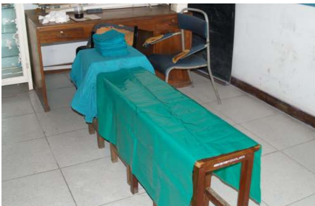
Figure 2 Picture of bench draped with polythene sheet for a patient preparation station.

The intubation station was carried out using adult intubation mannequins ("Airway Larry," Nasco Health Care) and adult laryngoscopes. The chest model used to teach chest tube insertion consisted of a teaching-skeleton rib cage draped with layers of foam and opaque vinyl that were sewn shut (Figure 4). Students were to review anatomy on a volunteer male student, isolating the fifth rib on