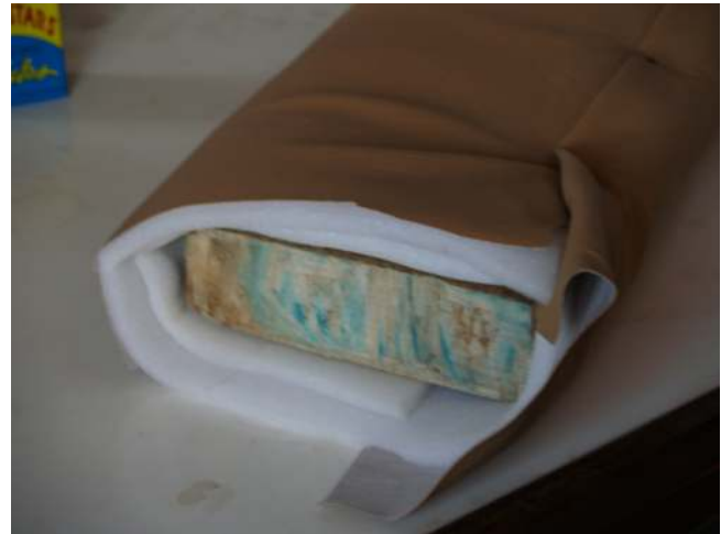
Figure 3 Picture of foam suturing boards for knot-tying and suturing skills station.

the anterior axillary line, insert the chest tube in the mannequin, secure the tube in place with suture, and close the chest tube opening with a suture upon removal of the tube.