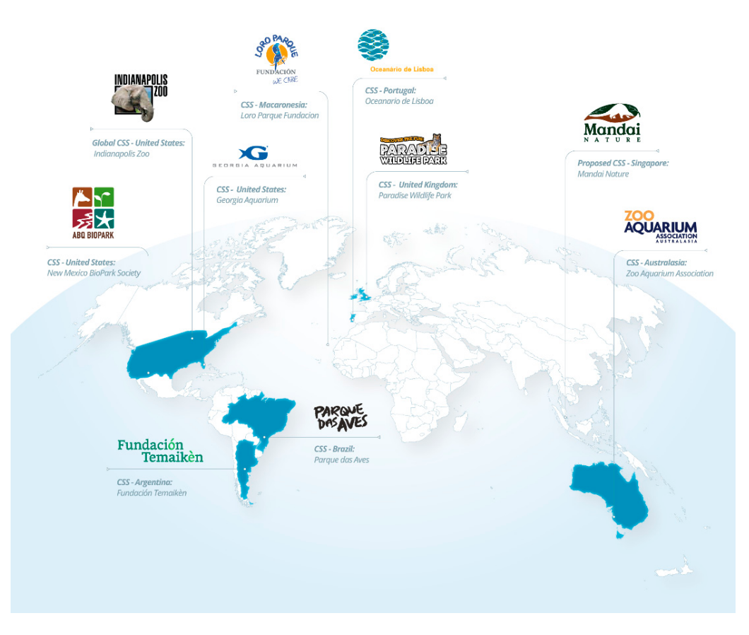
Figure 3. Distribution of SSC Centers for Species Survival.