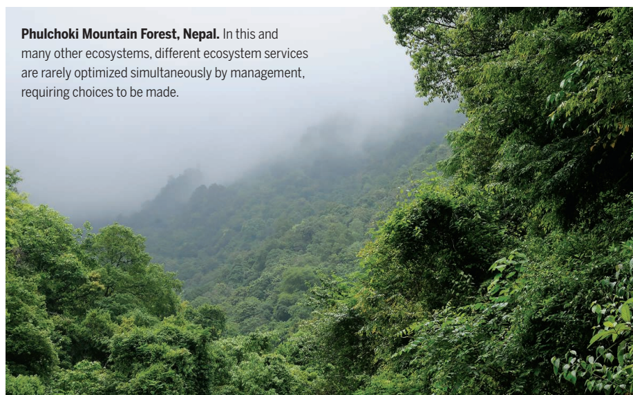
Phulchoki Mountain Forest, Nepal. In this and many other ecosystems, different ecosystem services are rarely optimized simultaneously by management, requiring choices to be made.