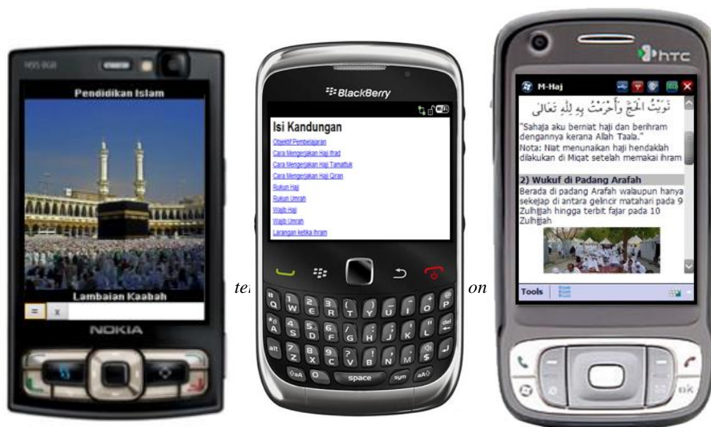
Figure 1 below shows the results of the mobile technology application design that has been developed. This mobile technology application was developed using the Learning Mobile Author version 4, which can be downloaded for free on the website. The mobile phones that support this mobile technology application for teachers includes Blackberry, Nokia, Samsung, HTC and mobile phones with Java ME 2.0 software. The design and development of mobile technology application were based on the ADDIE instructional model because it is suitable to any kind of learning.