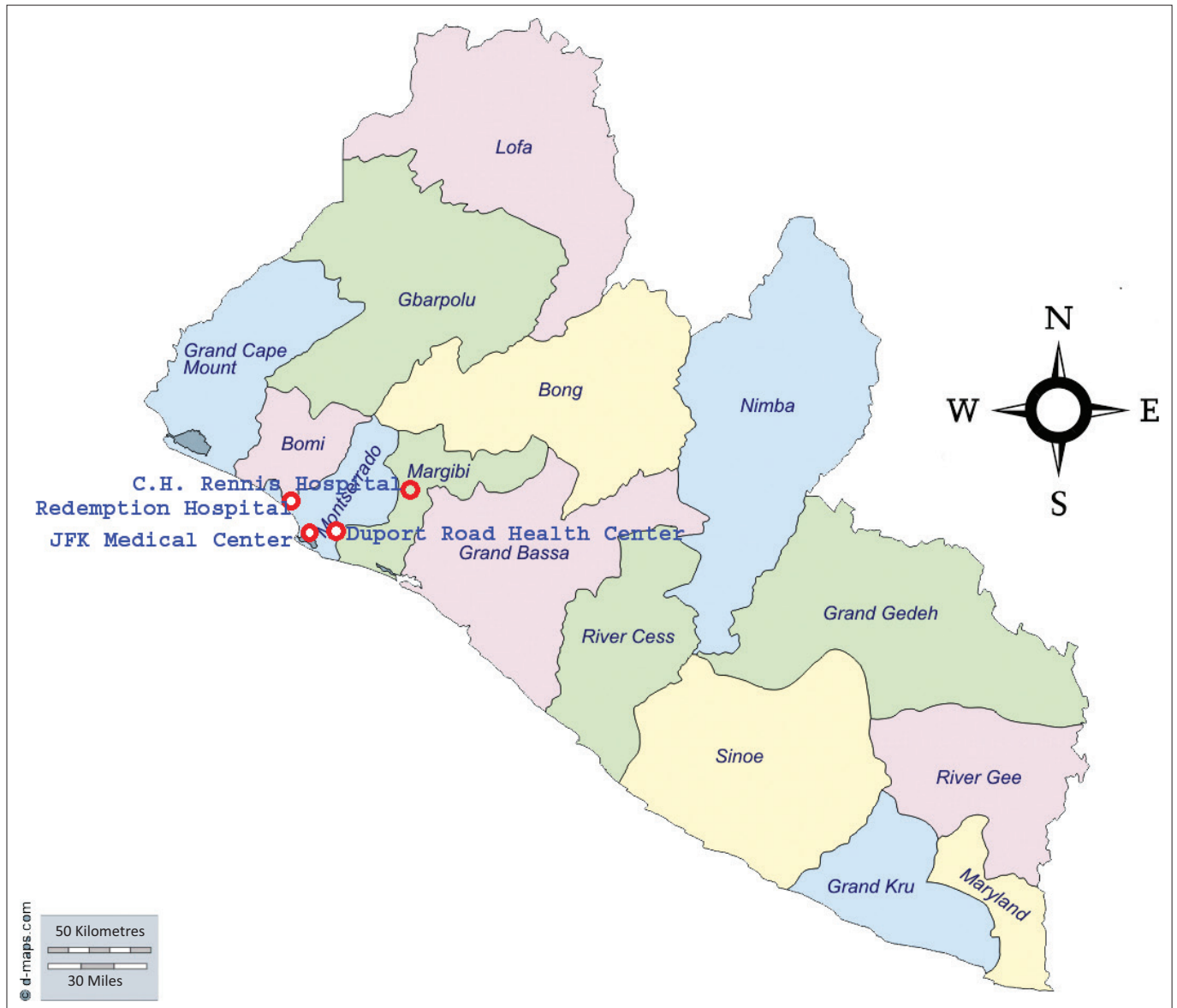
FIGURE 1: Map of Liberia and location of study sites.

and the goal was to identify a 'healthy' population. Following this step, for each laboratory test, the reference limits defined by the 2.5th and 97.5th percentiles were determined based on a commonly used non-parametric approach. 19,20 Percentile values were back-transformed to the original scale. Because it is important that reference ranges consider age and sex, this process was performed separately for each sex and age group (6–11, 12–17, and 18 years and over). The median and reference ranges are cited for male and female individuals in each of the three age groups. The percentage of participants both below and above published US reference ranges 21 are cited for each laboratory value. The results found in this study and for other countries in West Africa are given for reader reference. No formal statistical tests were made for these comparisons. Non-parametric tests were conducted for differences in medians between male and female participants and among the three age groups by sex. All analyses were performed using SAS version 9.4 (SAS Institute, Cary, North Carolina, United States). P -values < 0.001 were regarded as statistically significant.