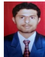
B.M Polytechnic, Solapur in MSBTE.