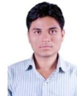
Dr. N.P. Hirani Institute Polytechnic, Pusad, Yawatmal in MSBTE.