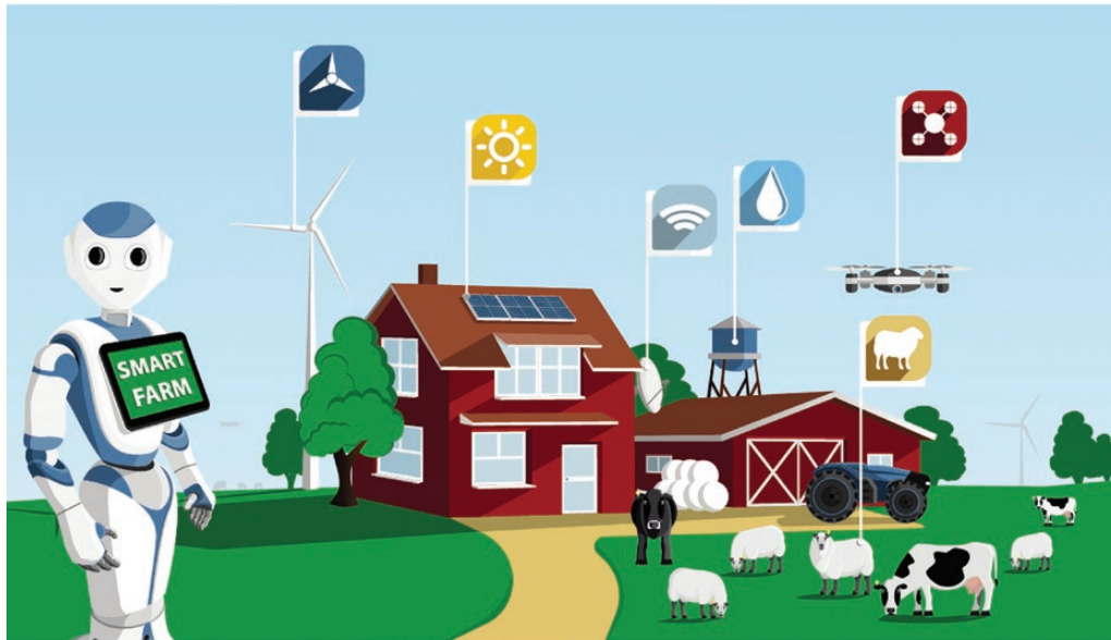
Figure 2. Illustration of different sensor components associated with the IoT to assist in integrating DST within the concept of smart farming or PLF systems. Adapted with permission from Tedeschi (2020).