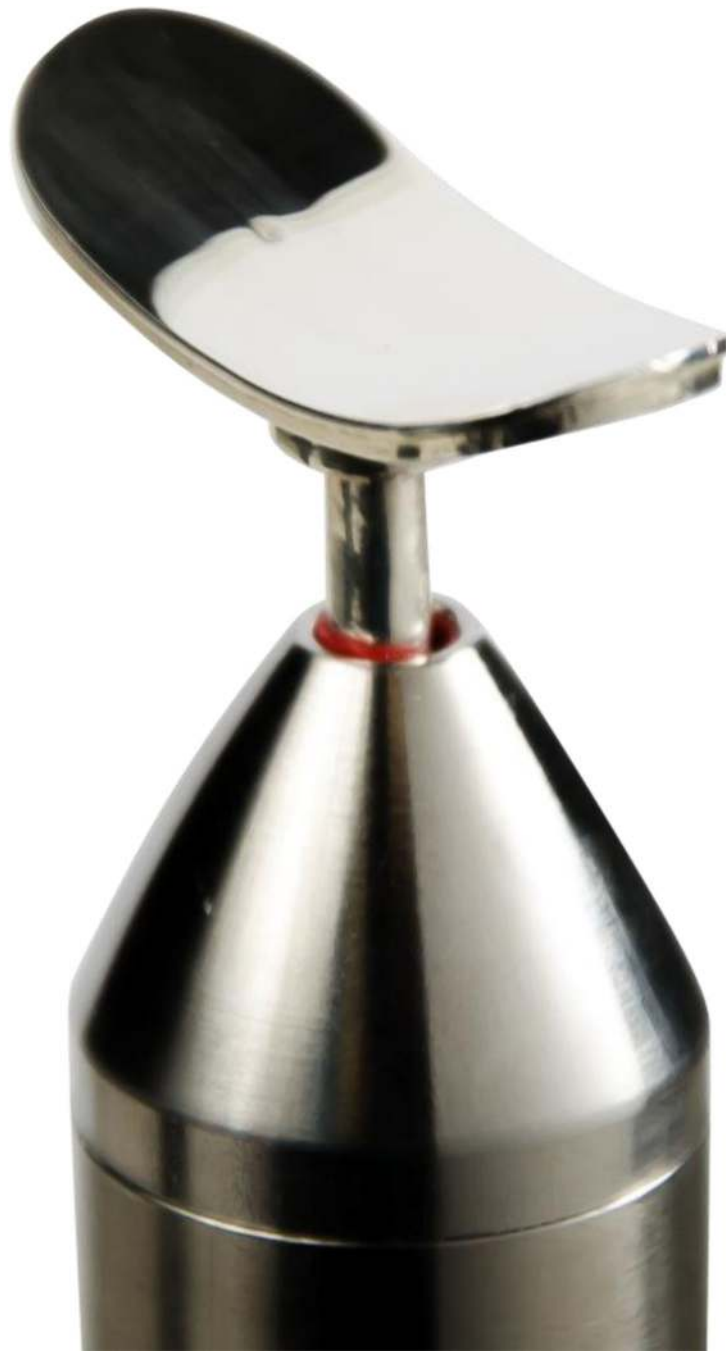
Figure 3: MiBo ThermoFlo application device