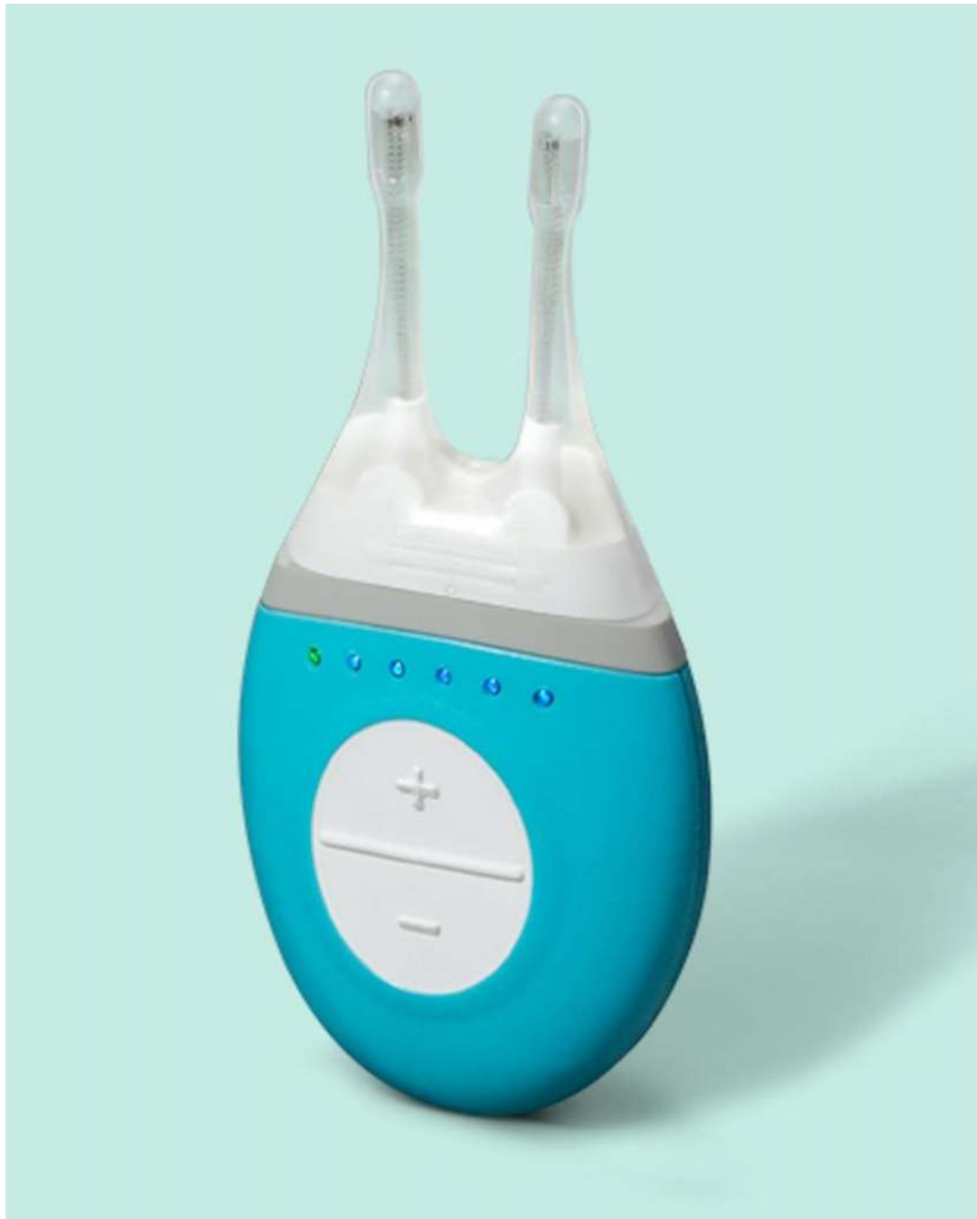
Figure 5: Intranasal Tear Neurostimulator