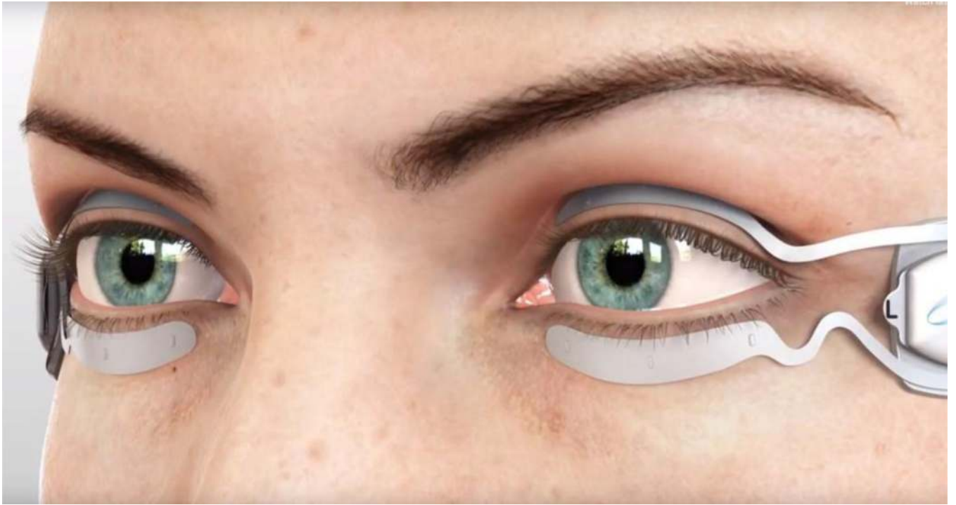
Figure 4: TearCare iLid device