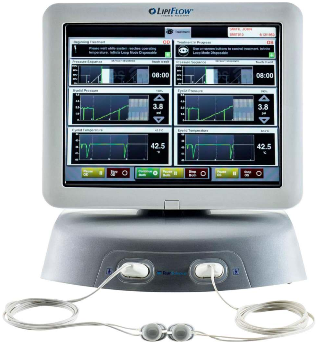
Figure 2: Thermal pulsation system