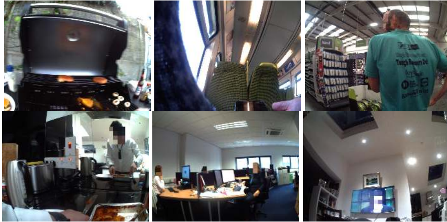
Fig. 1. Examples of Wearable Camera Images from the Dataset

a manual diet log and the inclusion of conventional photos. This makes it the richest personal lifelog dataset ever released. The data consists of: