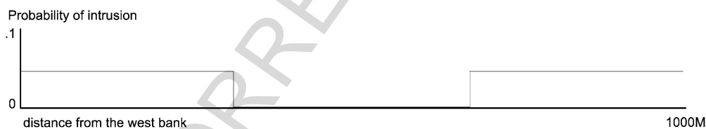
37 Fig. 1. The probability of an intrusion on the vertical dimension, and the location across the river on the horizontal dimension, from bank to bank.

71 The whale's possible intrusion is being anticipated 72 through the attention paid to the environmental con- 73 straints under which the whale operates. Whales rarely 74 swim up a particular river, so we have little data on 75 which to base our sensor placement. However, whales 76 are constrained by the currents, which we can monitor 77 with sensors. Since the currents of rivers and estuaries 78 change frequently, we can build sensors that monitor 79 the environment and move themselves into an optimal 80 configuration through reinforcement learning – with