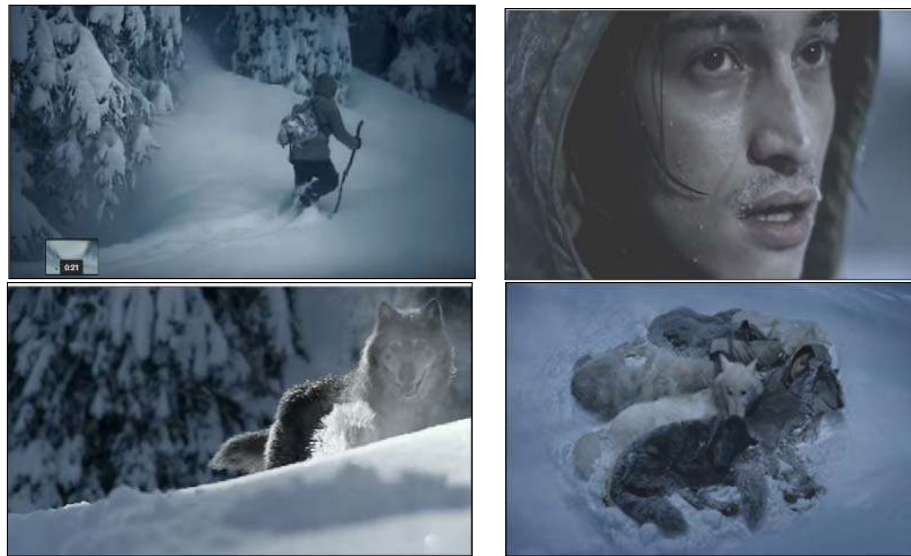
Figure 3. Screenshot TV commercial SL.