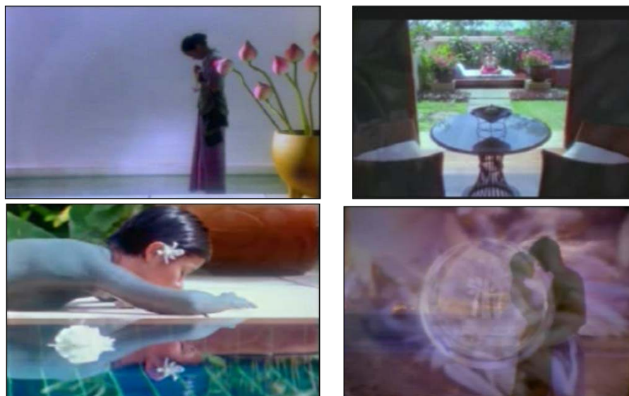
Figure 4. Screenshot TV commercial BT.

To evaluate which archetype people saw in the ads a test similar to Characterlab.com's test was designed which in turn is based on the Pearson-Marr Archetype Indicator [51]. After viewing the ads the participants had to rank attributes that described the ads. The survey was administered in the classroom using paper and pencil. Instead of asking directly what kind of archetype the participants saw, viewers had to rate attributes along three dimensions: Look, Feel and Talk. For example, fantasy landscape/creatures stood for Magician, pleasurable sensations for Lover on the Look dimension. On the Feel dimension the attributes enigmatic, transformational, mysterious and amazing stood for Magician whereas passionate, elegant etc. stood for Lover. Speaking about sensory experience stood for Lover on the Talk dimension. All in all five attributes per (12) archetype times three dimensions (look, feel, talk) were analyzed. The question the participants were asked on the Look dimension: "Thinking about what you saw in the commercial, please review the ad and give your overall impression of the SL/BL" 12 cards were handed out with each card having some explanatory text, e.g., for Caregiver "Caring staff, warm, comforting environment, loving, embraced, home-made food, and comfort." On the feel dimension the question was: "Thinking about how the BL/SL commercial makes you