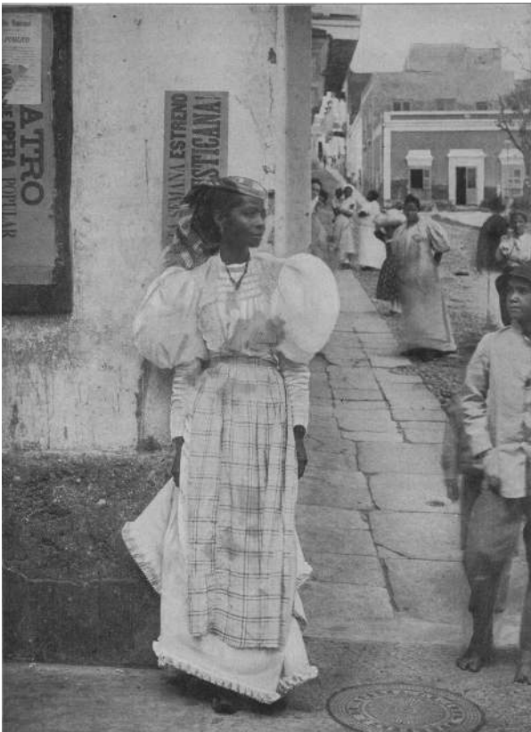
FIGURE 4. “A Coloured Belle of Puerto Rico”. White, Trumbull (1898) Our New Possessions . Adams, Boston, p. 357.

appearance, the labor process, wages, and the cost of living: