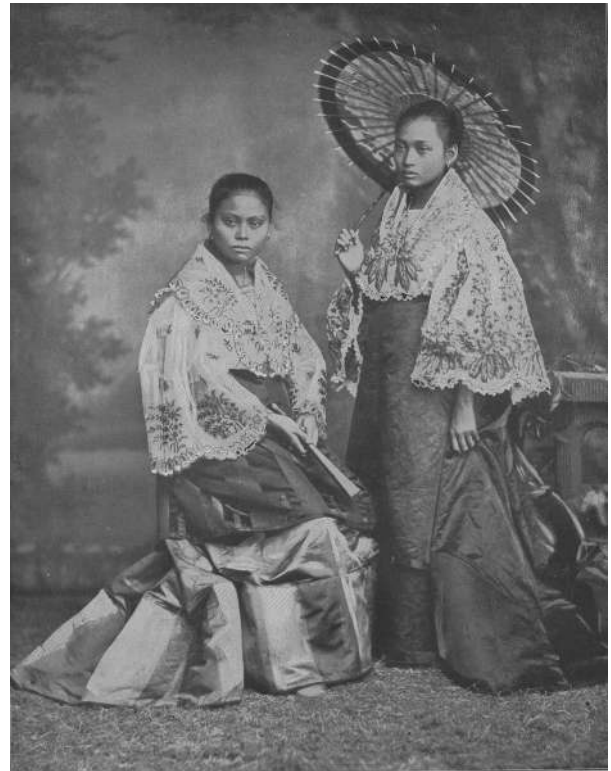
FIGURE 16. "Native Women". Lala, Ramon Reyes (1899) The Philippine Islands . Continental Publishing, New York, p. 306.

Olivares had mixed feelings regarding the high-class women. He published the same photograph as that shown in Figure 16 with a caption that emphasized their elegant dress and their ability to "converse as fluently as the women of civilized countries." (Olivares, in Bryan 1899: caption 645) However, in another caption he stated that the "cast