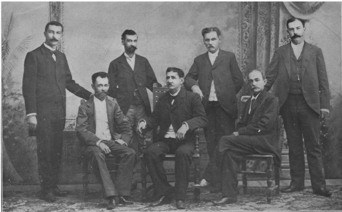
FIGURE 7. “Supervisors of the Puerto Rican Census”. Census of Porto Rico, 1899 , frontispiece.

The average denizen of San Juan is a silent, but most eloquent, exponent of habitual somnambulism. He appears to be perpetually wrapped in slumber. I have sometimes thought his ambulatory hours, if anything, the more restful, because therein he need never so