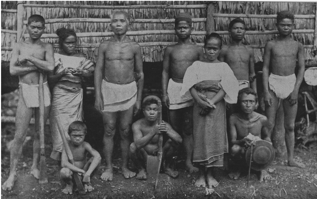
FIGURE 18. “Natives of the Island of Luzon”. Bryan, William S. (editor), (1899) Our Islands and their People, as Seen with Camera and Pencil . Thompson Publishing Company, St. Louis, p. 552.

statistics, and photographic representations of the dozens of supposedly distinct ethnicities that inhabited the islands. In these official reports the conclusion was unanimous: an “aggregate of tribes,” all in various levels of civilization and some clearly hostile, did not constitute a modern nation and could not govern themselves. In the following photograph (Figure 18) we can see an example of the “natives” from the island of Luzon. Although the caption did not identify the “tribe” to which this group belonged, their scarce clothing, rudimentary implements, and generally unfriendly demeanor underlined the conclusion reached by the colonial officials (Thompson, 2010: 118–131).