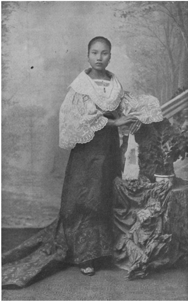
FIGURE 15. "Type of High-Class Woman of Manila". White, Trumbull (1898) Our New Possessions . Adams, Boston, p. 194.

vivid than the facts warrant." Here Olivares quoted Ramon Reyes Lala, the Manila-born author of The Philippine Islands , which was published in 1899. Lala and Olivares printed many of the exact same photographs, but their respective descriptions varied considerably. Lala (1899: 93) described these native women in the most favorable terms (Figure 16). Of the upper-class women, he wrote the following: "Many of the women are pretty, and all are good-natured and smiling. Their complexion, of light brown, is usually clear and smooth; their eyes are large and lustrous, full of the sleeping passion of the Orient. The figures of the women are usually erect and stately, and many are models of grace and beauty."