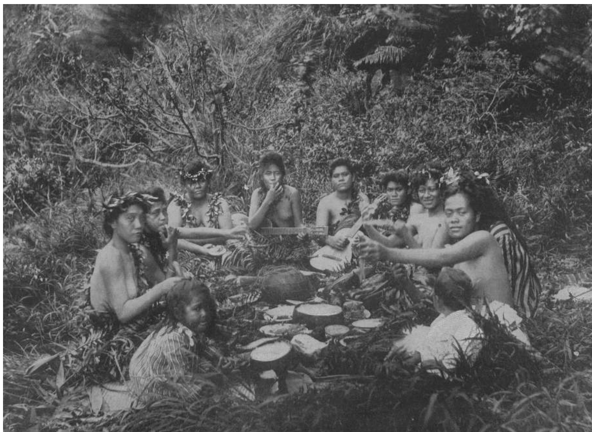
FIGURE 10. “Luau or native feast”. Bryan, William S. (editor), (1899) Our Islands and their People, as Seen with Camera and Pencil . Thompson Publishing Company, St. Louis, p. 427.

Other photographs showed the custom of the luau, an outdoor feast. Figure 10 appeared originally in Our Islands , but it was reprinted in several later books (Boyce, 1914), an indicator of its popularity. The photograph showed a group of women and children outdoors. The group is seated on the