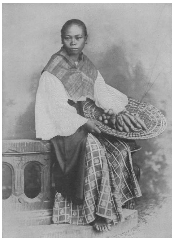
FIGURE 17. "Native Fruit Seller". Bryan, William S. (editor), (1899) Our Islands and their People, as Seen with Camera and Pencil . Thompson Publishing Company, St. Louis, p. 663.

Central to this trope was the shift from descriptions of women of the upper class to those of the lower and then to racialize them. Olivares (in Bryan, 1899: 663) pictured a native fruit seller (Figure 17) and wrote in the caption that the women of the "lower orders have an unpleasant cast of countenance, which indicates a surly disposition." He found that none of the women who sold fruits and flowers on the street were good looking, and their "dispositions are not, as a rule, of the most loveable character." The final degradation of the Filipinas was the following simile, penned by Comfort (in Bryan, 1899: 590): "Her presence is needful, like that of the carabao [water buffalo]." Despite any virtues they might have—loyalty to the family, love of children, hard work—the authors reduced these women to a beast of burden, the water buffalo. It should suffice at this point to say that these hateful, scowling, ugly women were the counterparts of their rebellious menfolk, who were portrayed as unruly children who dared rise up in armed resistance when their claim to an independent country was denied. Indeed, Will Comfort (in Bryan, 1899, 591)