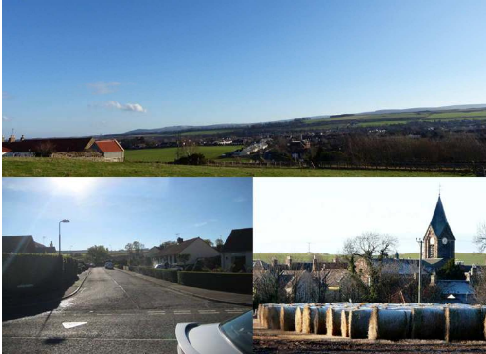
Figure 3: Montage of North Kirkton (Top Photo 'The View' and Left Photo 'The Hills from the Living Room'; Right Photo 'The Hay, The Village, The Hills')