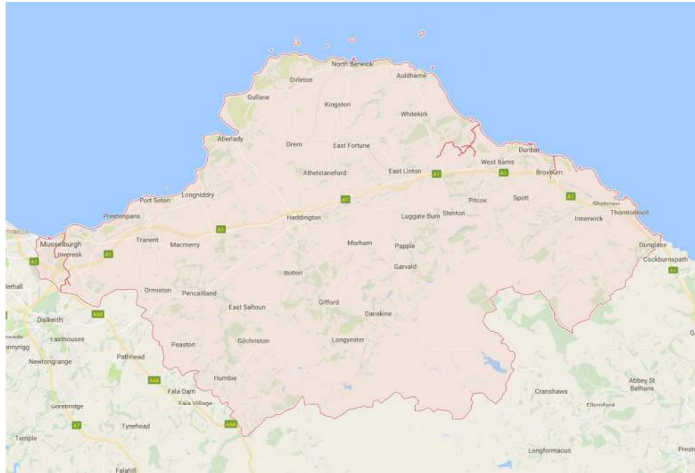
Figure 2: Map of East Lothian showing settlements and the principal transport network (Google Maps, 2017)