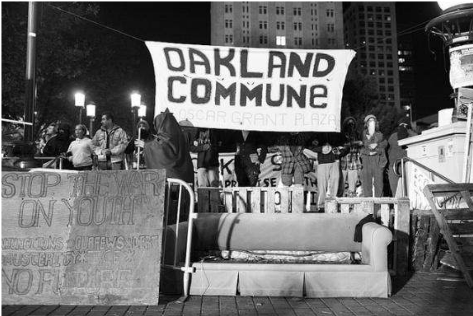
Figure 20 – Oakland Commune 1

In contrast with this populist narrative of Zuccotti Park, the Oakland Commune represents a distinct epicenter of contemporary anti-capitalist antagonism. What took place in Oakland during the explosive months of Occupy Wall Street was the result of a convergence of elements from the university anti-privatization movements and the growing anti-police movement that came to a head in 2009, with the assassination of Oscar Grant. On May 16, 2012, the Oakland Commune published the following critique of OWS, in an attempt to re-narrate developments in the social movement: