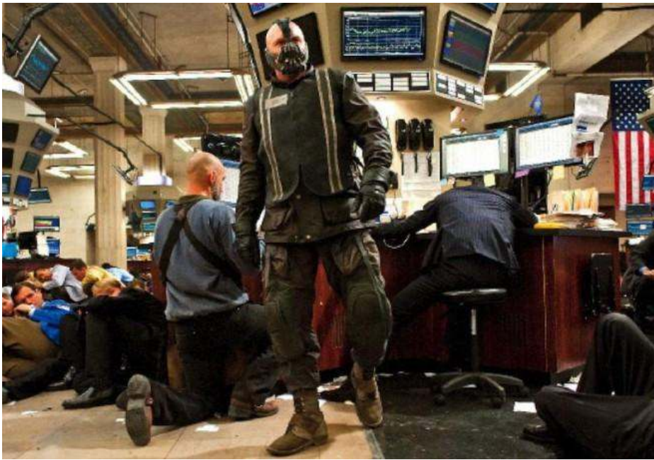
Figure 11 – The Dark Knight 1

The Dark Knight Rises (2012) is the third installment of Christopher Nolan’s adaptation of the Batman origin story, which incorporates dystopian tropes into its rendition of the super-hero narrative. In each of the films, Gotham City morphs between installments as an urban amalgamation of Chicago and New York. Between these films, we can observe a process of re-scaling “the strategic territories that articulate the new system” of what Saskia Sassen has called the “emergence of global cities” in neoliberal capitalism. Sassen describes the conditions of this emergence as: