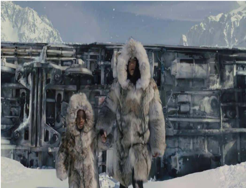
Figure 15 – Snowpiercer 2

Though it is perhaps a danger to suggest that this final sequence in Snowpiercer is a meditation on indeterminacy – risking the implication that the conditions of possibility for survival are a matter of ‘personal interpretation’ – I mean to suggest, to the contrary, that this indeterminacy should be read as an attempt to extend anti-capitalist critique to post-capitalist imagination. “Capitalist realism,” as Fisher explains, “is very far from precluding a certain anti-capitalism... Time after time, the villain in Hollywood films will turn out to be the ‘evil corporation’,” and yet, as he continues, “Far from undermining capitalist realism, this gestural anti-capitalism actually reinforces it.” (12) The marketability of anti-capitalist films since the 2008 financial crisis bares important lessons. While measuring political antagonism in this period, these films have also demonstrated the weakness of post-