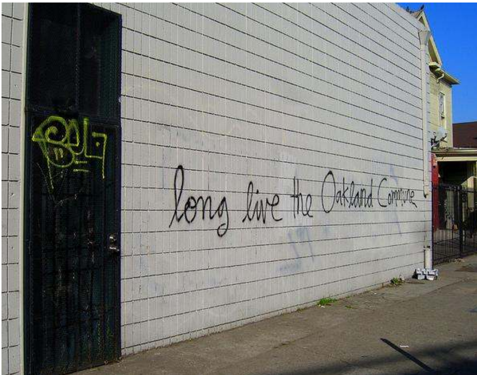
Figure 21 - Oakland Commune 2

As a struggle against the social conditions of global capitalism, Occupy is therein an active re-working of the spatial organization of social life. While drawing from the contemporary anarchist discourse of prefigurative politics, this notion of negative prefiguration posed by Bernes might also be taken up in a utopian framework – requiring a certain spatiotemporal dialectics that operates on these registers of negation and prefiguration at once. As the camp ceased to exist, the Commune became at once nowhere and everywhere – a discursive contact zone of anti-capitalist critique and post-capitalist imagining.