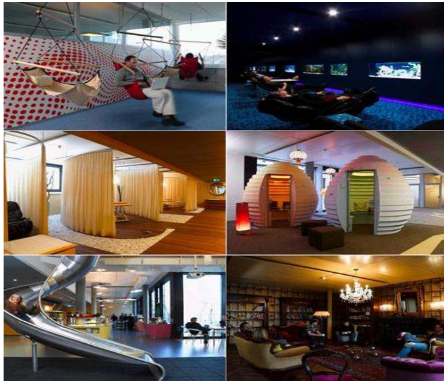
Figure 6 – Googleplex 2

The result of the 2003-2005 redesign of Google’s company headquarters is a kind of cruise ship office, in which employees have “free access” to massages, manicures, haircuts, teeth-cleaning, doctor visits, as well as foreign language classes and online courses. The Googleplex includes a bowling alley, basketball courts, three wellness centers, a bowling alley, a roller-hockey rink, ping-pong tables, arcade games, foosball tables, a rock-climbing wall, a putting green, and volleyball courts. The space also features an indoor tree house, manicured gardens, apiaries, and a sculpture garden. As Ron Friedman explains, “At Google, eating is serious business”: