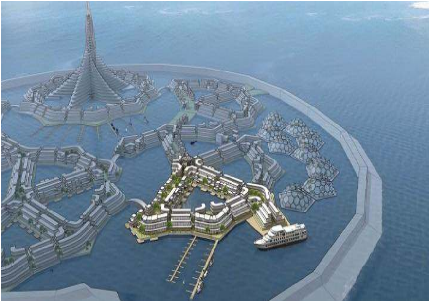
Figure 4 – Floating City Plan

large part due to Thiel’s funding contributions. “The Floating City Project” was launched in 2013, and in March of 2014, a 134-page report was published on the design and implementation of floating startup cities. The report obtained data from 1235 potential residents, and now has several planned projects.