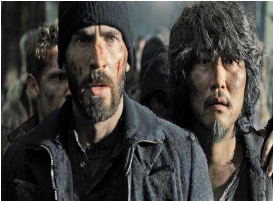
Figure 14 – Snowpiercer 1

Curtis's journey to the engine compels the plot, while Namgoong's scheme to escape remains peripheral. Yet throughout the film, there is a central tension between these ideological constructs of the realist and idealist, through a sustained critique of the notion of impossibility. While certainly adapting many of the tropes of post-apocalyptic nihilism, the film nevertheless resists the conditions of possibility and impossibility of the dystopian genre. It is in this sense a persistently utopian film, which – in decentering the Captain America analog of Curtis – makes available a whole different set of interpretations through Namgoong. By the end of the film, Curtis confesses to Namgoong that in his first months in the tail section, he had cannibalized other passengers: