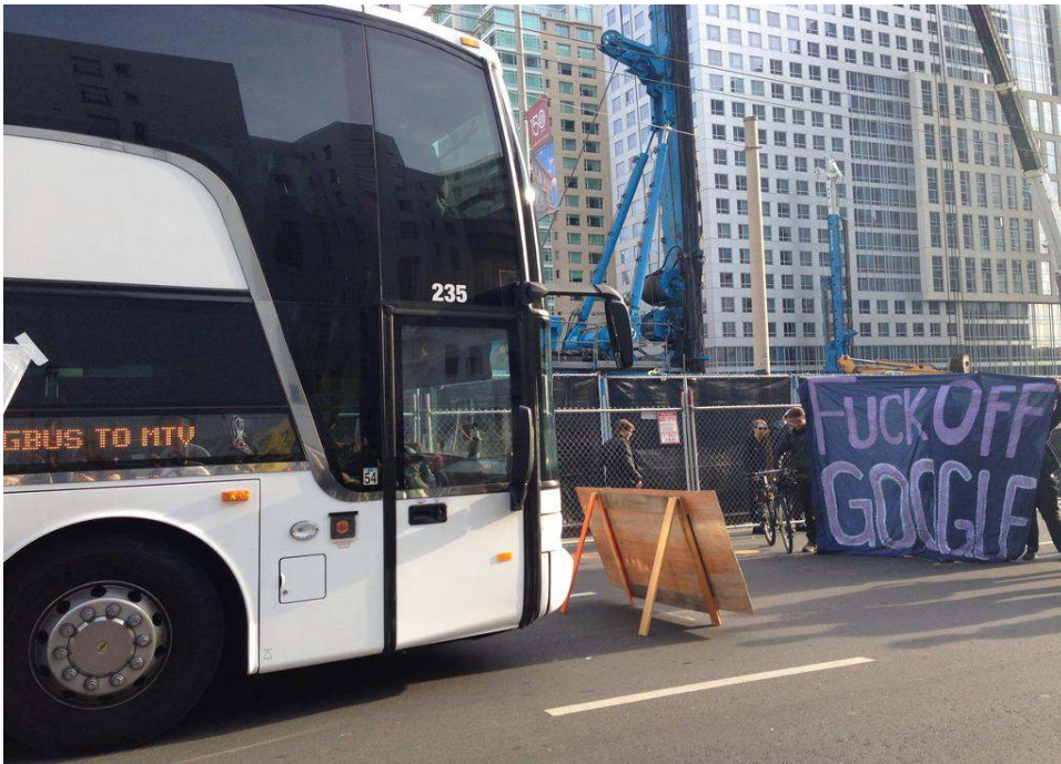
Figure 8 – Google Bus

The Google Bus localizes a certain dystopian imagination of the company in the contemporary situation – yet “the company’s reputation is seemingly unassailable. Google’s colorful, playful logo is imprinted on human retinas just under six billion times each day, 2.1 trillion times per year,” as Julian Assange bemoans in his recent book. Assange elaborates this dystopian conception of the company, uprooting their corporate rhetoric: