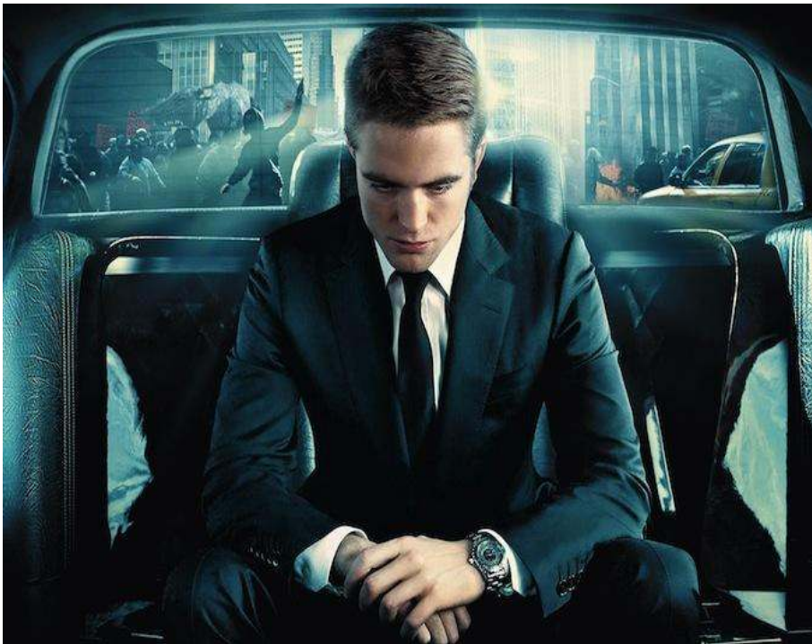
Figure 10 – Cosmopolis

the outside world. Cosmopolis interiorizes this historical process in the confinement of the limousine and Packer's self-destruction, but it cannot imagine beyond this contained space of collapse. The utopian impulse of the film is in this sense the imaginary of crisis and immanent destruction – a slow, crawling death in the limousine as a heterotopia in decay. All the while, the revolt remains occluded, illegible, and unknowable. The future is opaque and unactionable.