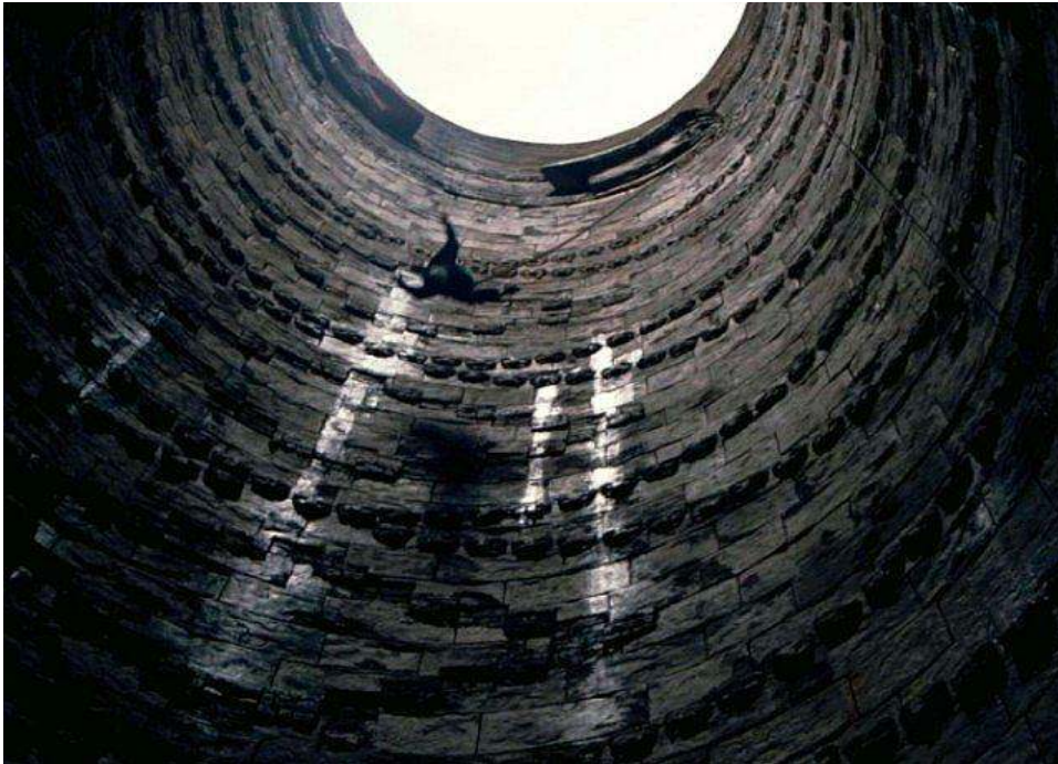
Figure 13 – The Dark Knight 3

reform.” (Weeks 175) Wayne, throughout the film, figures this necessity for small-scale modifications to the privatization of Gotham – it is merely a matter of a charity from the elite class. Bane, in his illegibility as a revolutionary terrorist, articulates the film’s foreclosure of utopian imagination and post-capitalist possibility.