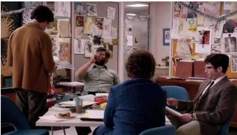
Figure 3 – Mad Men 2

the sort of self who can thrive in the CI environment is hardly a given... Particularly useful to the process has been the valorization of a labour profile typical to the struggling artist, which drums up understandable desires for creative and stimulating work.” (Brouillette, “The Trouble With Creativity”) As a sustained study of the innovator as a historical type – here, as an extension of Lukacs’s notion of typicality – Mad Men ’s historical imaginary of the American 1960s must be understood and ideologically situated in a typology of the present moment.