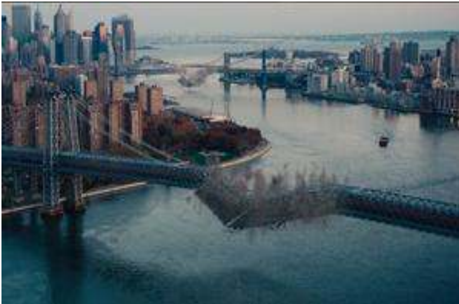
Figure 12 – The Dark Knight 2

The last of The Dark Knight series most strongly conceptualizes Gotham as a global city through the production of centralization – a characteristic which Sassen argues is the necessary spatial counterpart to the processes of dispersal in global networks. When Bane seizes power of the Stock Exchange, his group of revolutionaries proceeds to block off the bridges and subways to enclose the island of Gotham.