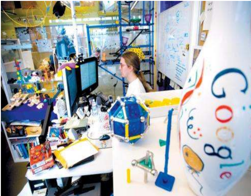
Figure 7 – Googleplex 3

The Googleplex can be understood as a complete spatialization of the “dissolving of most of the borders between private and professional time, between work and consumption,” necessary to the 24/7 markets for continuous work and consumption that Jonathan Crary describes of late capitalism. (Crary 15) The result is a ‘workplace utopia’ that produces, as Chang suggests, “a world beyond worlds where everyone is smart, and invention and necessity coexist. The impulse is both beautiful and endlessly arrogant, an adolescent’s willful dream.” Through all aspects of its architecture, as Peter Jakobsson and Fredrik Stiernstedt argue,