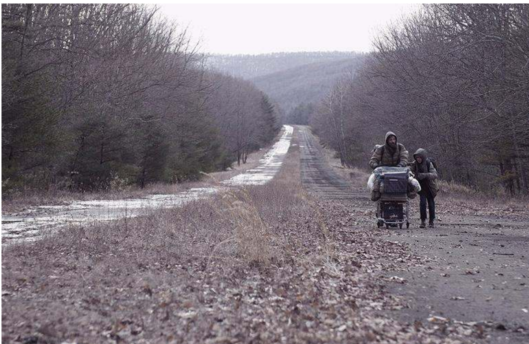
Figure 19 – The Road

In the 2009 film The Road – adapted from the post-apocalyptic novel by Cormac McCarthy – a dystopian future is imagined in which the remnants of capitalism are the only redemptive elements. As a post-financial crisis film, The Road conceives of a future transformed by an unknown catastrophe. A boy and his father travel through a landscape of perpetual war among survivors reduced to cannibalism, pushing a shopping cart through the ruins of late capitalism. The dystopian narrative is driven by a utopian vision of this irretrievable past, a vision of post-capitalist possibility that goes hand-in-hand with even greater catastrophe.