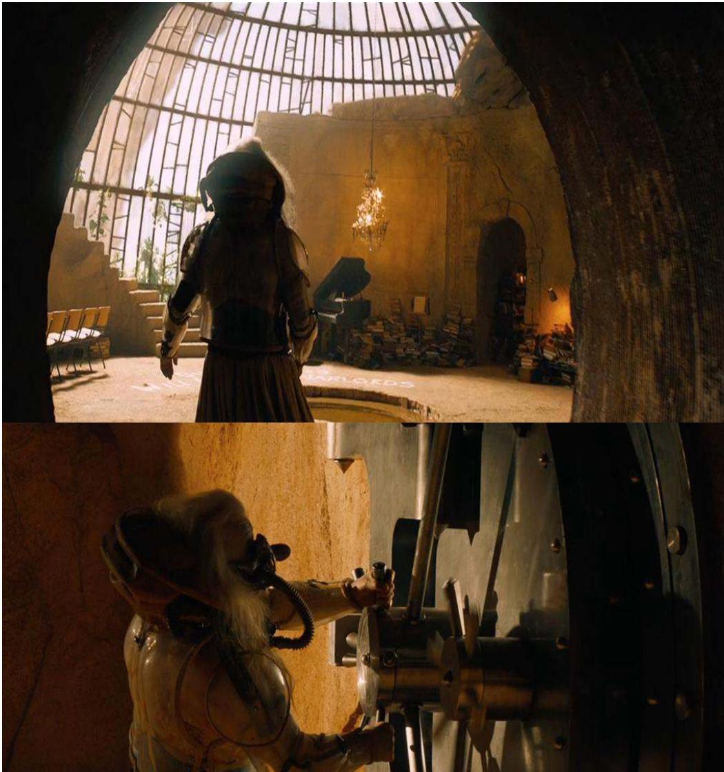
Figure 18 – Mad Max: Fury Road 3

While being uninterested in its own characters, Fury Road is also uninterested in its own allegory. Like Snowpiercer , the film demonstrates a waning of the allegorical function in the dystopian genre, instead developing an intensely spatialized imaginary of subjugation as an analogy to the present. Like the train, the road must be destroyed – or at least, decapitated as an allegory. The road’s purpose of escape is reversed – the characters are driven by revolution over retreat. The