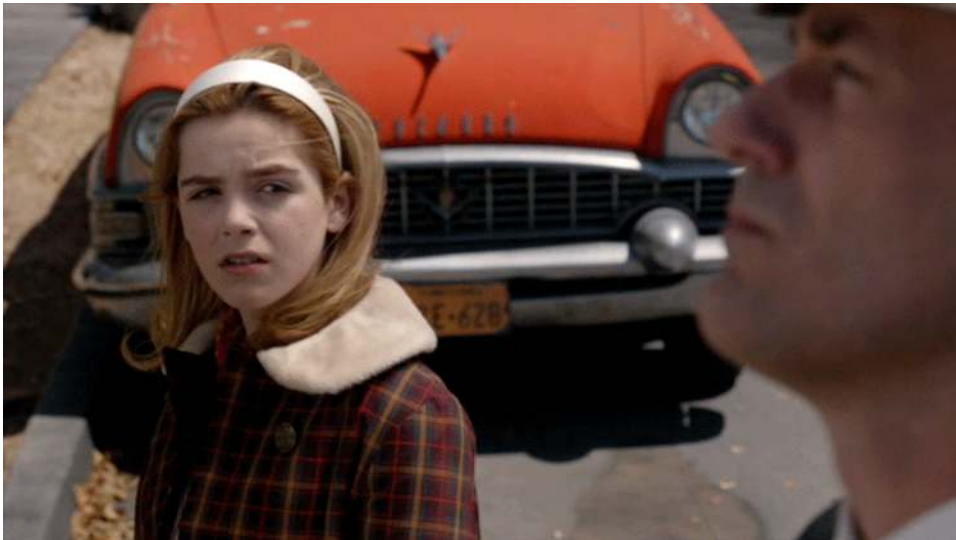
Figure 2 – Mad Men 1

she thought he was – a realization already confirmed for the viewer, as a witness to Draper’s life history of opportunism and manipulation. The viewer discovers early on that Draper was born by another name, that he has a secret history – a history that remains latent, like the post-60s, through the course of the series as a disaster waiting to happen.