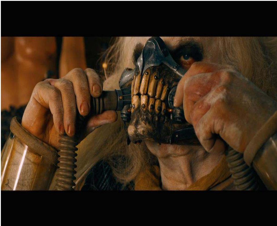
Figure 17 – Mad Max: Fury Road 2

Fury Road is a fascinating meditation on the possibility of post-capitalism, for which the decisive moment is this turn back to the citadel. Not only is their return a demand of the impossible, but an attempt to think through the already existing possibilities of post-capitalist social reproduction. Under Joe's tyranny, the resources of the citadel have been privatized. Scarcity is rather an ideological construct – the precondition for Joe's power, and the condition by which Furiosa and Max diverge in their sense of possibility. While in Snowpiercer , the train's dysfunctionality is conceived as unsalvageable, Joe is the site of dysfunction in Fury Road , kept alive with an elaborate respiratory machine and plastic-encased armor.