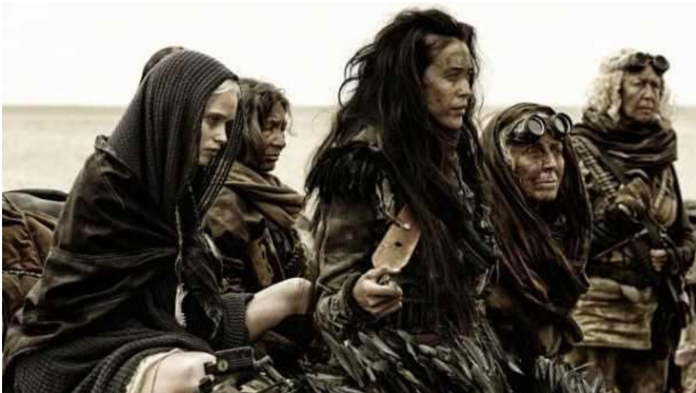
Figure 16 – Mad Max: Fury Road 1

consists of an ornately carnivalesque chase, in which Furiosa becomes comrades with Max, and the wives become more adept using guns. Furiosa, Max, a rehabilitated War Boy, and Joe's wives eventually reach a collectivity of women in the desert, but they are told that the "Green Land" could not be maintained, and eventually became a swamp where nothing could grow. At first, Furiosa and the women part ways with Max, furthering their distance from the citadel. Max catches up to them, however, and persuades Furiosa – in a decidedly un-feminist scene, despite much of the film's reception – that they should instead return to the citadel and assassinate Joe. In the end of the film, when the surviving heroes return to the citadel with Joe's corpse, they are celebrated by all the citizens. While Max vanishes among the masses, the women are raised on a lift up to the top of the citadel, in order to re-establish social relations with already existing modes of production and social reproduction.