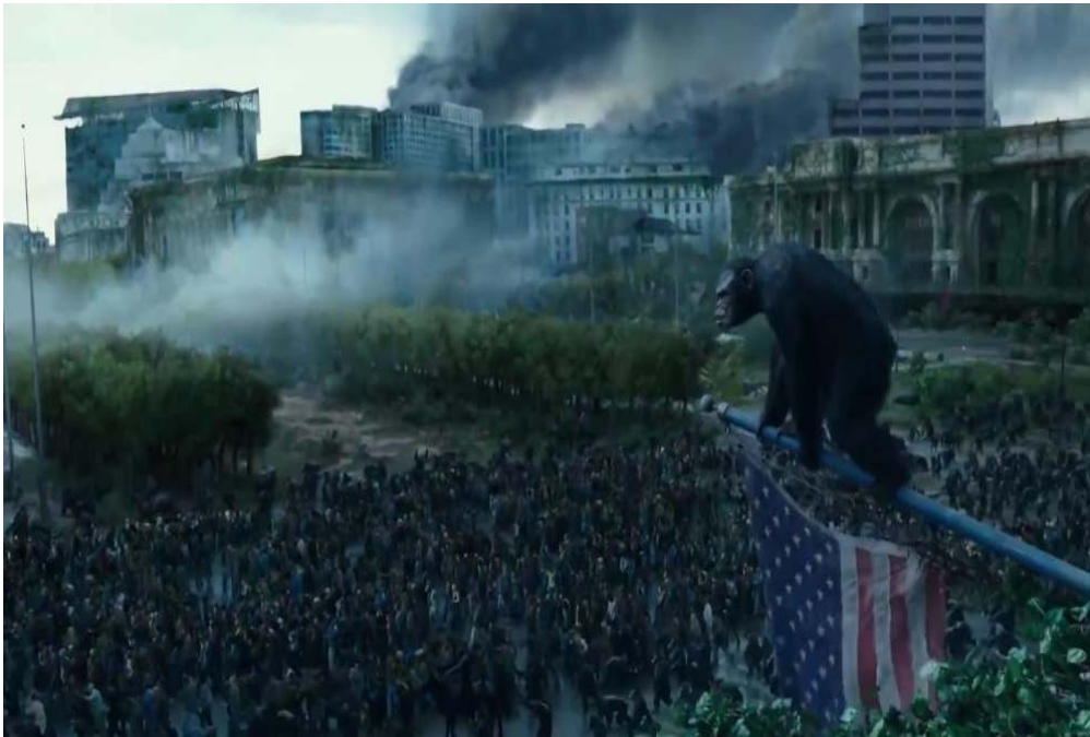
Figure 9 – Dawn of The Planet of The Apes

While the film may be a “pacifist blockbuster,” Dawn of the Planet of the Apes is certainly also a sustained engagement with the critique of radical militarism that, some would argue, brought on the dissolution of the Occupy movements in 2012. The notable critiques include Chris Hedges’s reactionary denunciation of Black Bloc tactics, “The Cancer of Occupy,” Rebecca Solnit’s moralistic essay “Throwing Out the Master’s Tools and Building a Better House,” each of which contributed to the commonsensical liberal discourses that were being mobilized on the ground level in the encampments. Moreover, in its division between encampments, the film privileges a form of liberal individualism that exceeds collectivities and rationalizes leadership. The most interesting part of the film is the building antagonism between apes Caesar and Koba, who represent the pacifist and militaristic extremes of their