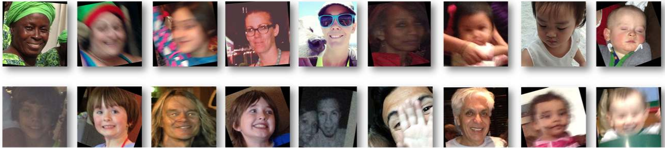
Figure 4. Gender misclassifications. Top row: Female subjects mistakenly classified as males. Bottom row: Male subjects mistakenly classified as females