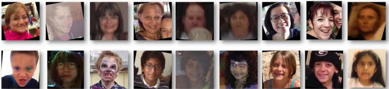
Figure 5. Age misclassifications. Top row: Older subjects mistakenly classified as younger. Bottom row: Younger subjects mistakenly classified as older.