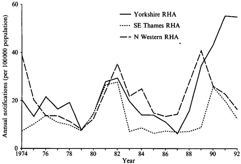
Fig. 2. Annual notifications of infective jaundice per 100000 population in three NHS Regions of England 1974-92 (1992 totals are provisional).