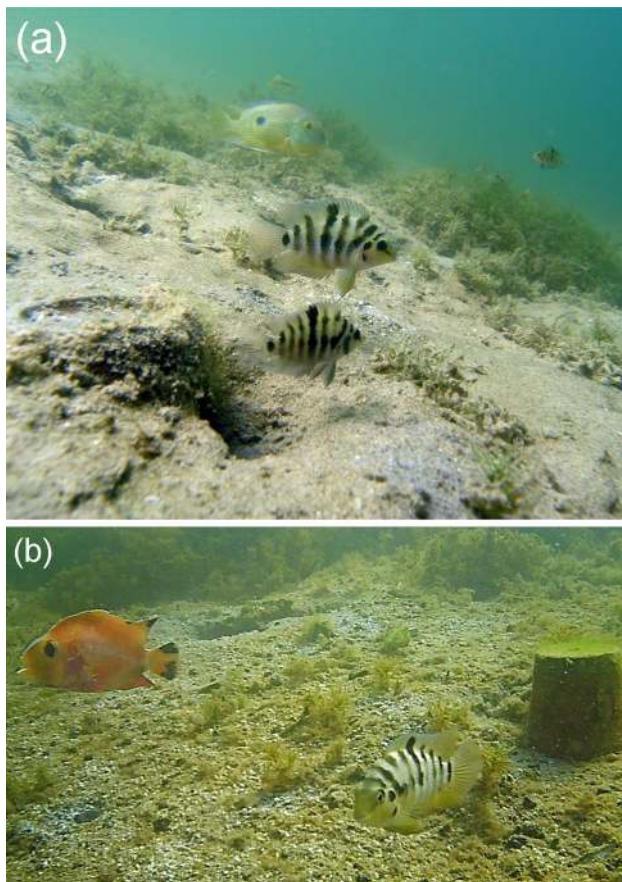
Fig. 1 Convict cichlids occupying an artificial nesting resource and on the background a a moga male and non-breeding convict cichlids and b the intruder model

nearby or farther away). Finally, I tested the hypothesis that the focal convict cichlids might invest less energy into territory and brood defence when their territory is located close to a moga or conspecific territory.