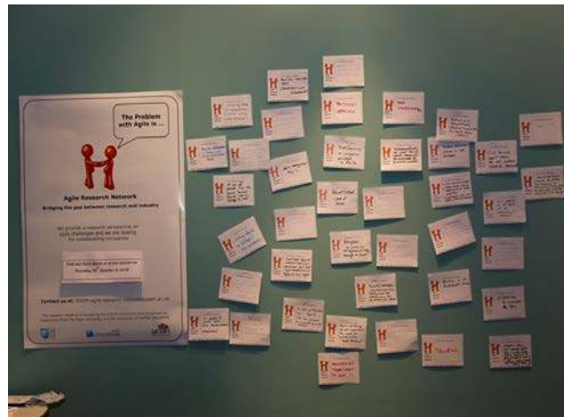
Figure 1: The Challenge Wall at ABC 2013

suggested that researchers should aim to understand the drivers of agile adoption as well as its effects [9]. The call for more research continued in 2009 by Abrahamson et al. [10], who also identified a need for more rigour and industrial studies, as well as highlighting a lack of clarity about what was meant by agility. More recently the research landscape has changed. Both Dingsøy et al in 2012 [11] and Chuang et al in 2014 [12] have reported an increase in published research, indicating a maturing field.