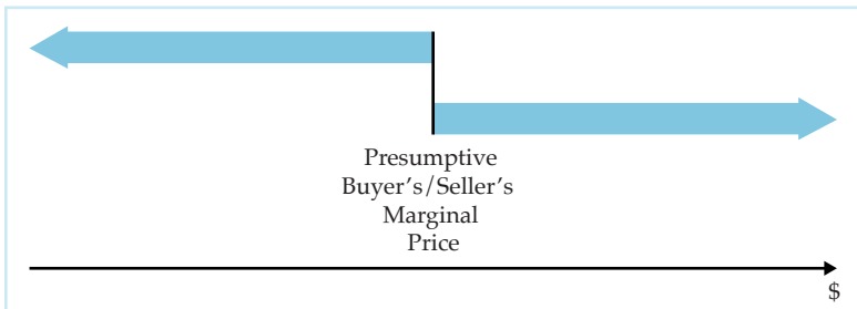
Figure 2: Presumptive Seller's Marginal Price = Presumptive Buyer's Marginal Price

If both the presumptive purchaser's and the presumptive seller's marginal prices equate to one another, however, the only price acceptable to both parties equals their common marginal price. Rothbard (2001, p. 109, footnote 23) discusses the same scenario and eventually concludes: "Thus, if Smith's maximum buying price is 87, and Johnson's minimum selling price is 87, the price will be uniquely determined at 87."