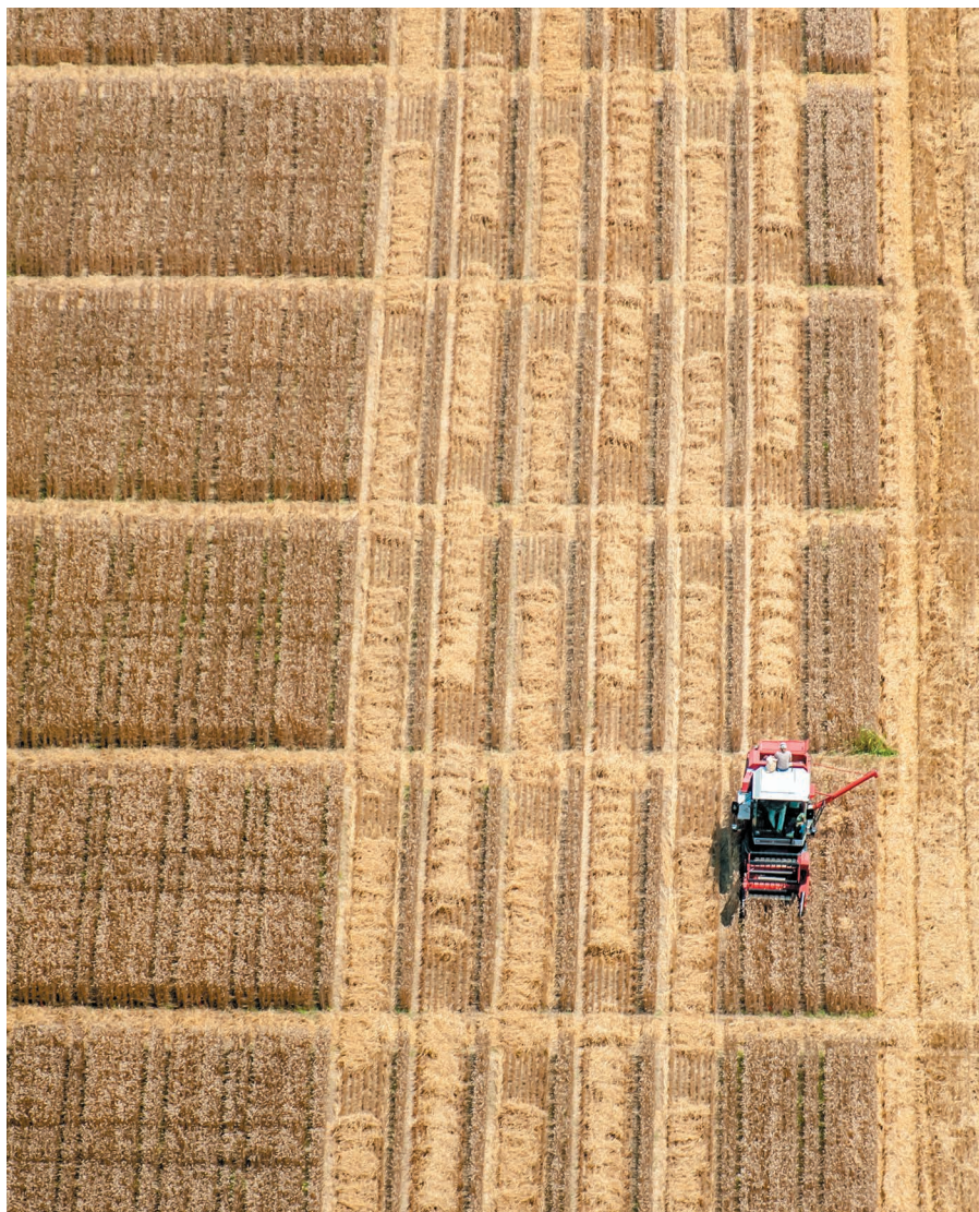
A wheat test plot in Maryland.