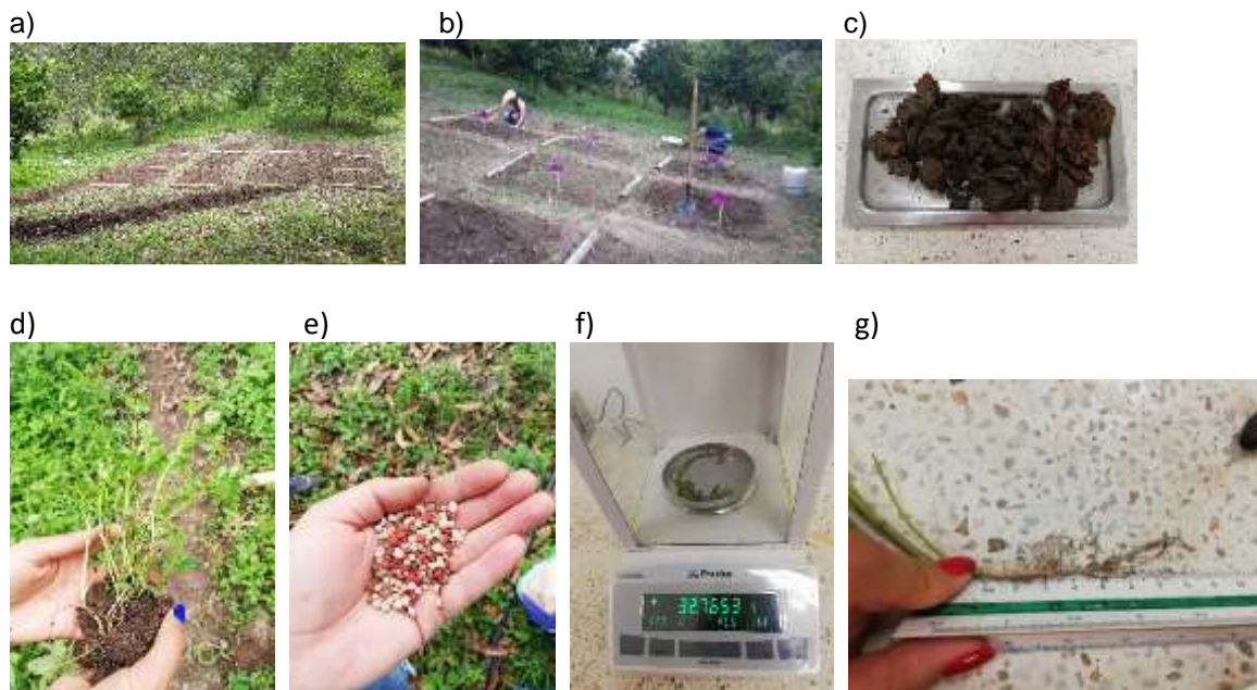
Fig. 1. Images of test: a) terrain by blocks, b) signaling for treatments, c) sludge for treatments, d) Coriandrum sativum obtained after 30 days, e) fertilizer NPK used, f) plant mass measurement, g) plant root length measurement after 30 days.

to the same conditions of temperature, shadow, and slope, among others. The terrain is shown in Fig. 1.