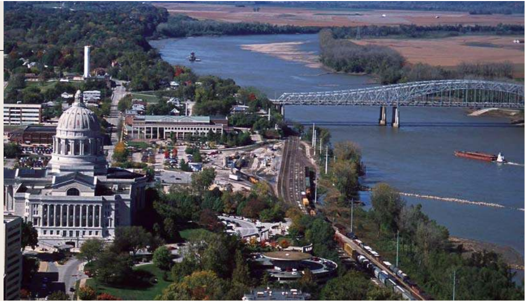
Sarah Minor, USDA/NRCS

Water quality trading is a market-based approach intended to reduce pollution at a lower cost than through traditional regulatory action. The Environmental Protection Agency and USDA are actively promoting water quality trading programs in watersheds impaired by pollutants, such as nutrients, produced by both regulated and unregulated sources, such as agriculture. Polluted runoff from agricultural fields is not regulated under the Clean Water Act, and greater use of trading might increase the number of farms willing and able to change their farming practices to reduce nutrient runoff.