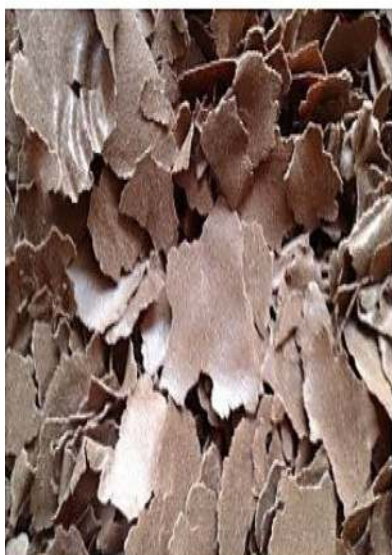
Ground nut oil cake