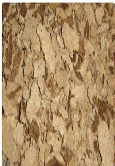
Coconut oil cake