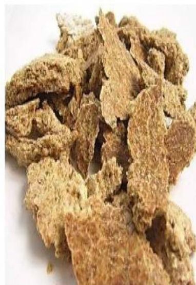
Soybean oil cake