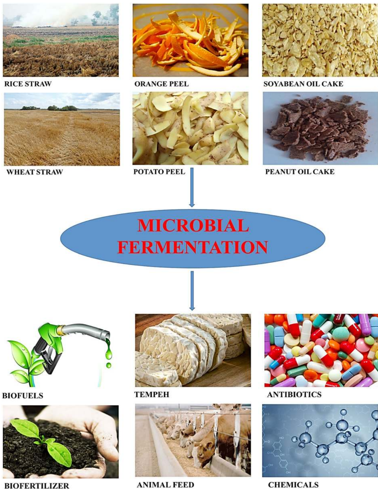
Fig. 4 Applications of agro-industrial wastes