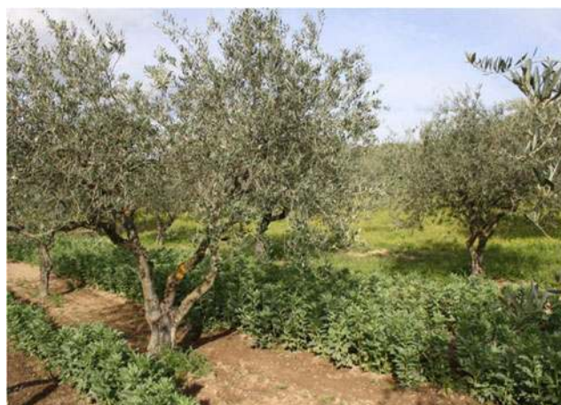
Fig. 5 Olive tree agroforestry system with undergrowth of leguminous species and grassland in Sardinia, Italy. This type of agroforestry system allows combining different crops on the same field. Resource use efficiency is increased because of different root systems, better nutrient cycling can be expected, legumes fix nitrogen, and below tree species cover the soil and wind and water erosion

Some plant species have the ability to produce chemical compounds which negatively influence the growth and development of weeds, pests, or diseases (De Albuquerque et al. 2011; Kruidhof et al. 2008; Tabaglio et al. 2008; Weston 1996). Therefore, the introduction of so-called allelopathic plants into crop rotations is a promising agroecological practice intending to reduce pesticide use while providing good crop yields. Allelopathic plants may be used as intercrops or cover crops. They have a direct effect on target organisms by