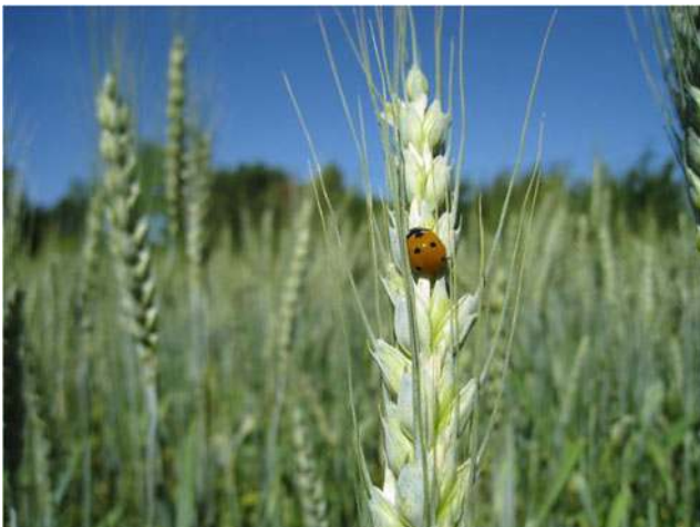
Fig. 1 Conservation biological control: preservation or creation of habitats near fields or in the larger landscape for reproduction, over-wintering, or shelter during different phases of life cycle of beneficial insects which then can control pests. The present photo shows a ladybird beetles, a natural predator of aphids, on organic wheat in southeastern France

Practices such as organic crop fertilisation, crop rotations, or biological pest control are well-known agricultural