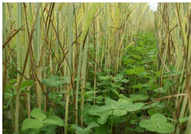
Fig. 4 Relay intercropping of wheat and undersown clover in southeastern France. In relay intercropping, leguminous species are often sown some weeks after the crop to reduce the risk of competition between crops. They assure a supplementary soil cover in particular after crop harvest. There, they limit nutrient leaching, wind, and water erosion, fix Nitrogen, and can potentially be harvested as forage

The intercropping systems are assumed to have potential advantages in productivity, stability of outputs, resilience to disturbance, and ecological sustainability, though they are generally considered harder to manage (Vandermeer 1989; Fig. 4). The main issue in such a system is managing competition for resources between the associated crops (Ong 1995; Ozier-Lafontaine et al. 1998; Van Noordwijk et al. 1996;