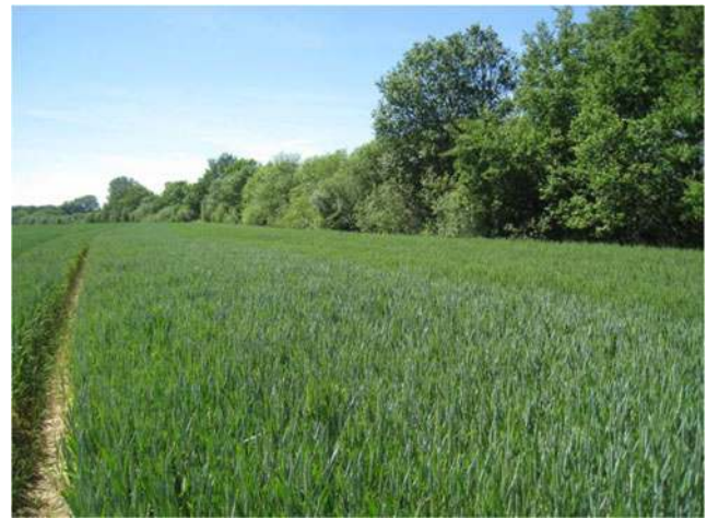
Fig. 2 Landscape elements surrounding a cereal field, southeastern France. Woody landscape elements for example can have different functions such as protection against wind and water erosion, habitats for beneficial insects and pollinators, production of timber and firewood, ecological corridors in agricultural landscapes, and biodiversity conservation