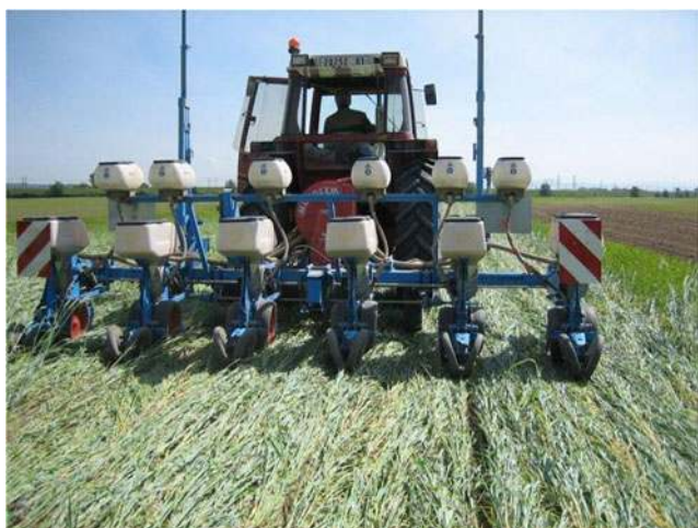
Fig. 6 Direct sowing of soybean into rye in southeastern France. This practice allows permanent soil cover and thus control weeds, decrease nutrient leaching, wind, and water erosion. Also soil organic matter is increased and higher soil biota activity achieved which leads to improved soil fertility

Reduced or no tillage practices help reduce energy inputs and thus increase cropping system efficiency. Other advantages are protecting the soil from erosion (organic matter at the soil surface), stocking organic C (less C mineralisation), and