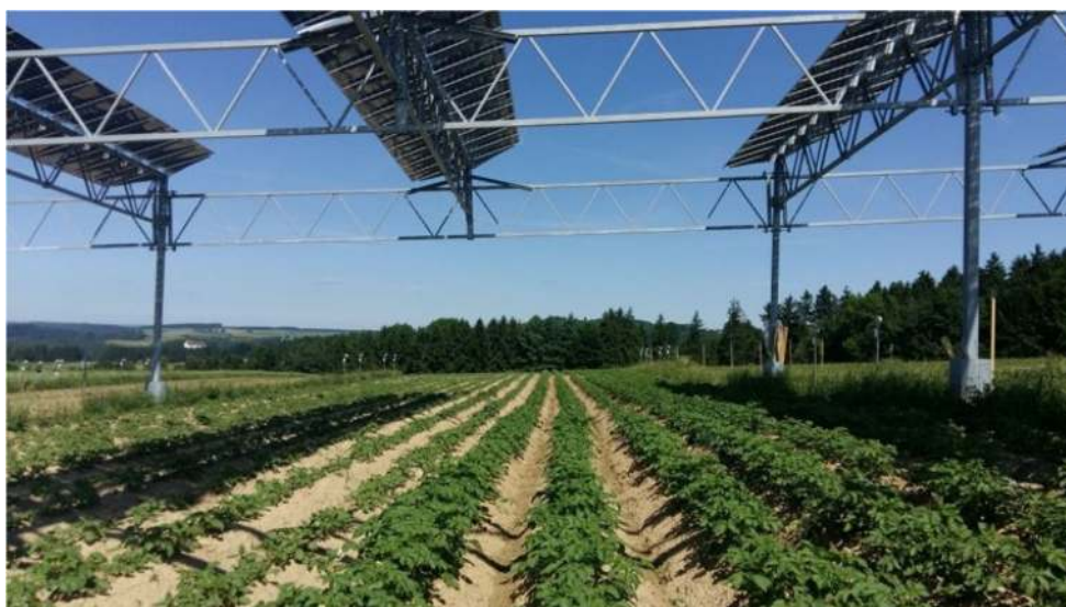
Fig. 1 Potatoes growing underneath an APV facility. The facility was set up within the project APV RESOLA and is located at Heggelbach, administrative district of Sigmaringen, Germany. Its implementation in agricultural production is currently investigated