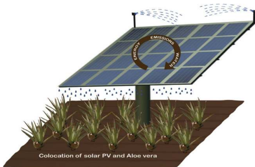
Fig. 3 Integration of PV module surface cleaning with irrigation system. Its application is also conceivable in APV systems. Run-off water of the PV module cleaning system can be collected or directly used to irrigate crops cultivated underneath

studies dealing with the impacts of APV and shade on crop production (Elamri et al. 2018; Rotundo et al. 1998). This is probably due to altered microclimatic conditions and also has an influence on field management as well as the marketing strategy of some crops (Elamri et al. 2018; Rotundo et al. 1998).