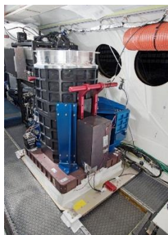
Fig. 2. Integrated IPDA lidar instrument inside a B-200 research aircraft

energy after normalization to the transmitted laser energy (laser energy monitor). The theoretical differential optical depth was derived using the US standard atmospheric model [5]. In addition, the IPDA measured differential optical depth was converted to CO 2 dry mixing ratio, using metrological data obtained from instruments that measure pressure, temperature and relative humidity. The measurement results were compared with an in-situ CO 2 and H 2 O gas analyzer (LiCor; LI-840A) at the site. General temporal profile trend agreement is observed between these two measurements.