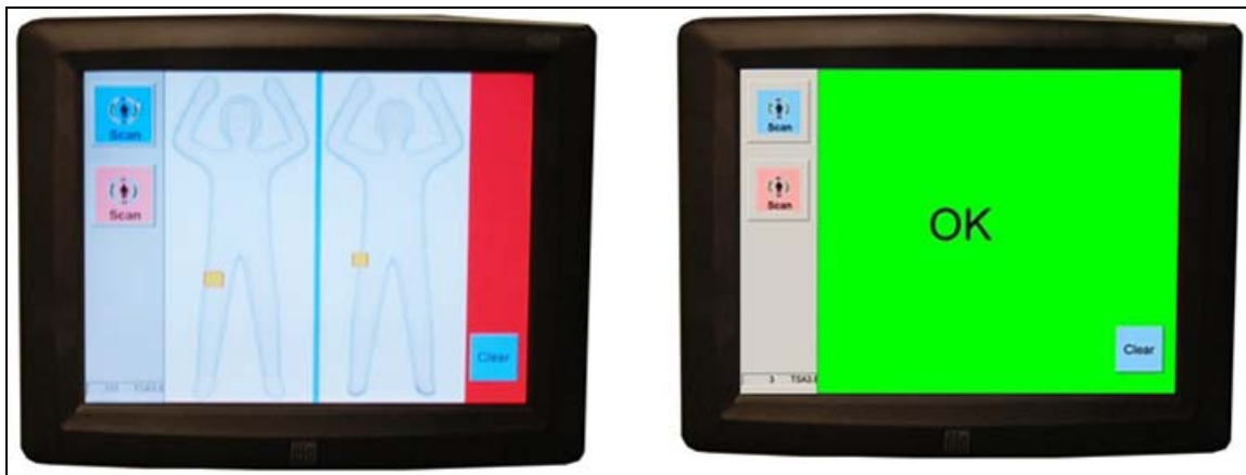
Figure 3. Millimeter Wave Automated Target Recognition (ATR) Display