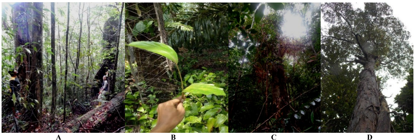
Figure 2. The Five dominant species in research site. A. Shorea acuminata (right) standing near Dipterocarpus cinereus (left), B. Arenga pinnata , C. Shorea falcifera , D. Hopea sangal

Note: RD= Relative Density; RF= Relative Frequency; RBA= Relative Basal Area; IVI= Important Value Index