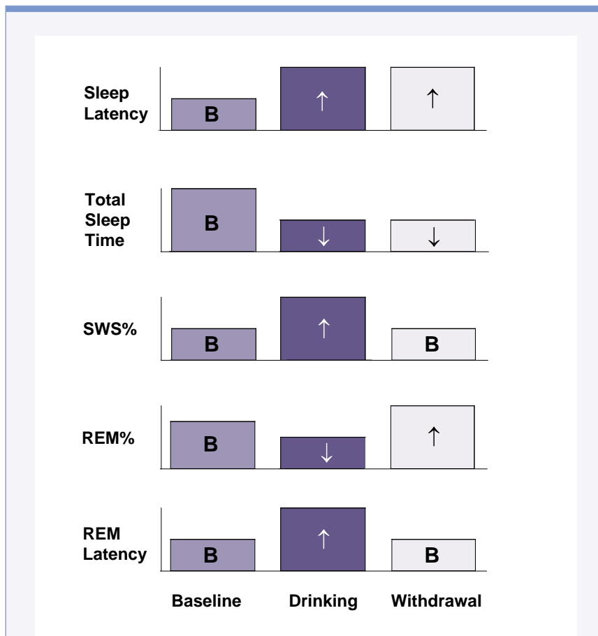
Figure 1 A summary of nocturnal sleep changes in alcoholic patients as determined across various polysomnographic studies of acute alcohol administration and withdrawal. The studies measured sleep characteristics at baseline, after drinking, and during acute alcohol withdrawal. Note that the size of the bars indicates only the direction , but not the magnitude , of the changes. Both after drinking and during withdrawal, sleep latency increases and total sleep time decreases, compared with the response at baseline. Both the percentage of deep sleep, or slow-wave sleep (SWS), and the rapid eye movement (REM) sleep latency increase during drinking and return to baseline levels during withdrawal. Although SWS% returns to baseline values during withdrawal, researchers should note that baseline values of SWS% in alcoholics are still lower than values from control subjects. REM% decreases with drinking and then returns to or even exceeds baseline levels during withdrawal.

NOTES: Sleep latency is the time between going to bed and actually falling asleep. SWS% is the proportion of deep sleep, or SWS, during total sleep time. REM% is the proportion of REM sleep during total sleep time. REM latency is the time between sleep onset and the onset of the first episode of REM sleep.