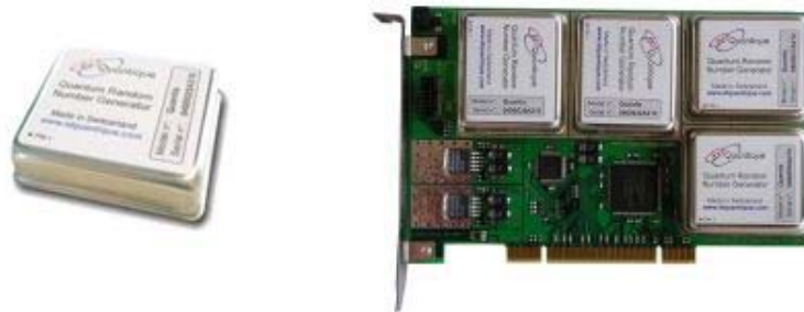
Fig. 2. Quantis: OEM and PCI, cf. [31]

A spin-off company from the University of Geneva, id Quantique , [30], markets a quantum mechanical random number generator called Quantis , see Fig. 2. Quantis is available as an OEM component which can be mounted on a plastic circuit board or as a PCI card; it can supply a (theoretically, arbitrarily) long string of quantum random bits sufficiently fast for cryptographic applications. 5