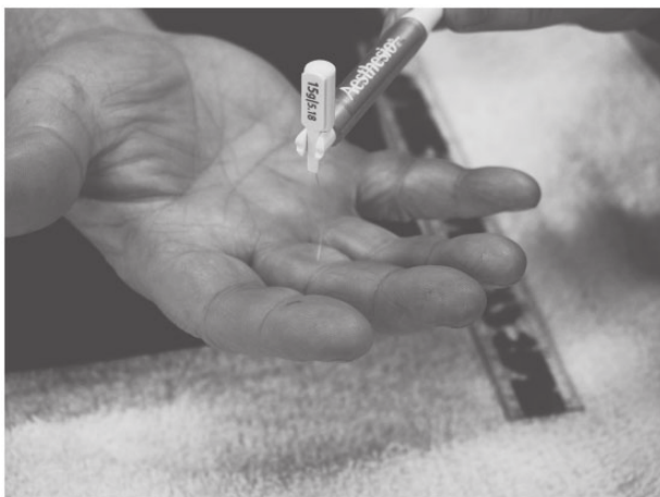
Figure 1. Allodyngraphy testing. Note the limb is stabilized on a cushion, while the filament is carefully applied with sufficient pressure until slight bowing is observed. This photograph illustrates the second step of evaluation, working from proximal to distal down the central limb axis on the volar surface towards the area of allodynia (in distal forearm for this participant).

moving proximally, until again the client indicated “STOP” (see Figure 1 for an illustrative photograph). A transverse axis roughly bisecting the painful area was similarly evaluated. The territory of the allodyngraphy was measured using anatomical landmarks (recording the distance from the landmark to the final “STOP” point on each axis) and recorded visually on graph paper (see Spicher et al. [12] for a detailed description of the procedure). For precision in our study, we asked the participant to identify when the qualities of the stimulus perception started to change. At that point, we would tap the monofilament on a water-based ink pad before subsequent application of every stimulus and switch to 1-mm increments, thus creating an accurate measurement point to record the “STOP” point when the subject indicated a painful response, without the need to reverse. Four “STOP” points were identified and measured with a flexible clear plastic ruler held approximately 2 cm above the skin. These were recorded visually on a standardized diagram (front and back of right and left hands) with the measurement indicators (Figure 2). To pragmatically account for the nonrectangular shape of the allodynic territory, we calculated the area of allodynia as length (most proximal and distal points identified) * width (most lateral points identified) * 0.66 (Figure 2).