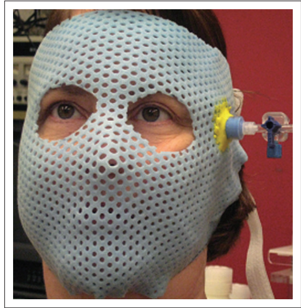
Fig 1.—Mask used for the application of pressure pain. An example of the mask used to deliver pressure pain stimuli to each subject.

Analysis 1b: We performed correlation analyses (Spearman rank correlation) looking for significant correlations between pain measures (pain duration, BPI scores, MPQ scores), depression and anxiety measures. Correlations were deemed significant at