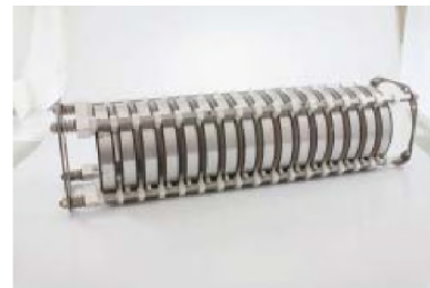
Figure 2 MPS

The MPS 5 takes advantage of the interactions of closely spaced transducers to increase the radiation impedance and thus increase the relative power transmission at low frequencies. The MPS uses a very large active surface area to spread the energy and stresses seen by the source and also minimize the magnitude of motion required to achieve the desired sound pressure level. This results in a relatively robust system, compared to devices with moving parts that require seals and other regular service parts.