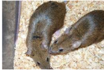
Figure 1. Triple transgenic mouse (3xTg-AD).

The triple transgenic (3xTg-AD) mouse, which develops pathologies associated with AD, was created in 2003 ( Figure 1 ). To produce this model, Oddo's team simultaneously microinjected two genes (APP and tau) into single-cell PS1M146V mouse embryos (transgenic mice that overexpress human or wild-type APP, and are hybrids from the 129/C57BL6 strain). These mice develop both amyloid plaques and NFT-like pathology in a progressive and age-dependent manner associated with anatomical and temporal analogously to that observed in the human AD brain [16]. In this 3xTg-AD, A \beta deposits initiate in the cortex and progress to the hippocampus with aging ( Figure 2 ). Amyloid accumulation is localized in the basal neocortex as well as in entorhinal areas, but this accumulation can also expand into the hippocampus. The conformational or hyperphosphorylation changes characteristic of tau pathology occur particularly in pyramidal neurons of the hippocampal CA1 subfield and in cortical structures ( Figure 3 ) and evolve in the AD brain [164].