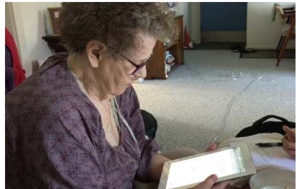
Figure 1: COPD patient using Ambuflex Telehealth System.

This paper is a two-fold contribution: 1) We propose a telehealth-based extension to Li's 5-stage model and follow-ups [4, 9, 16]. The extension cover voluntary self-tracking behavior and reflection and identifies Our telehealth extension identifies key differences and touch points where patients reflect in the process of self-tracking. 2) We identify key sub-stages in the Collection stage of Epstein et al.'s [9] Lived Informatics Model and discuss the implications for patient reflection.