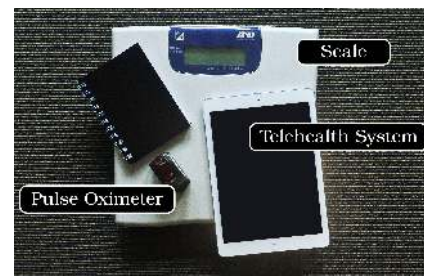
Figure 3: The Ambuflex telehealth kit & a patient notebook.