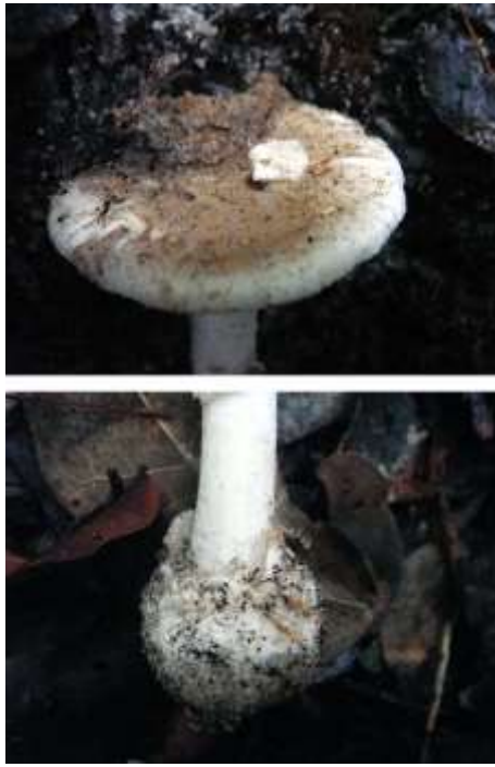
Figs. 2–3 – Amanita psammolimatula . 2 Detail of pileus surface with patch of universal veil. 3 Details of the bulb showing the limbate universal veil. Bars = 10 mm.