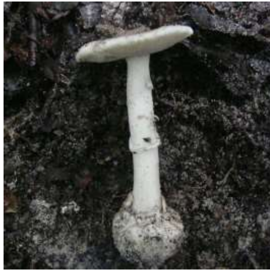
Fig. 1 – Basidiome of Amanita psammolimbata . Bar= 20 mm.

as modified by Yang (1997). We follow the emended methodology of Tulloss (2000) for biometric measurements and biometric variable names which are summarized by Tulloss and Lindgren (2005).